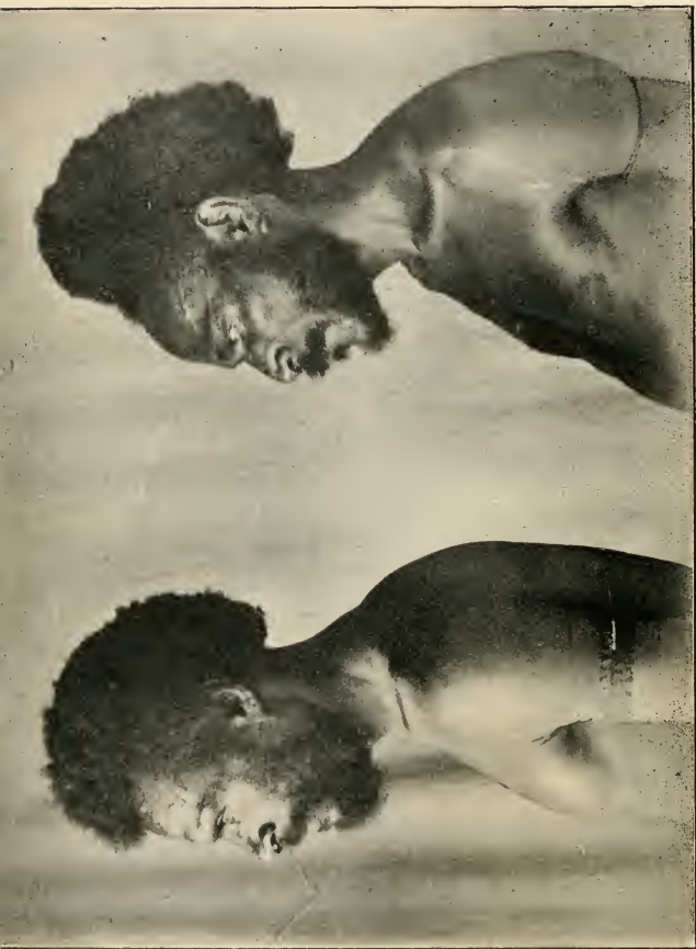
PAPUANS, KOIARI TRIBE.