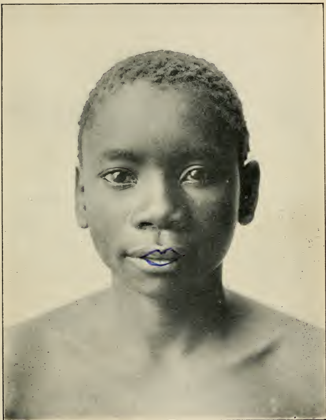
NEGRILLO, Kasai Valley, Congo.