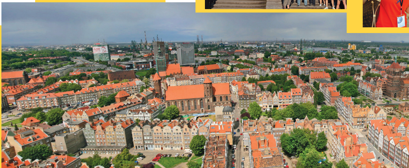
Michał Stupczewski (www.slupczewski.pl), CC BY SA 3.0