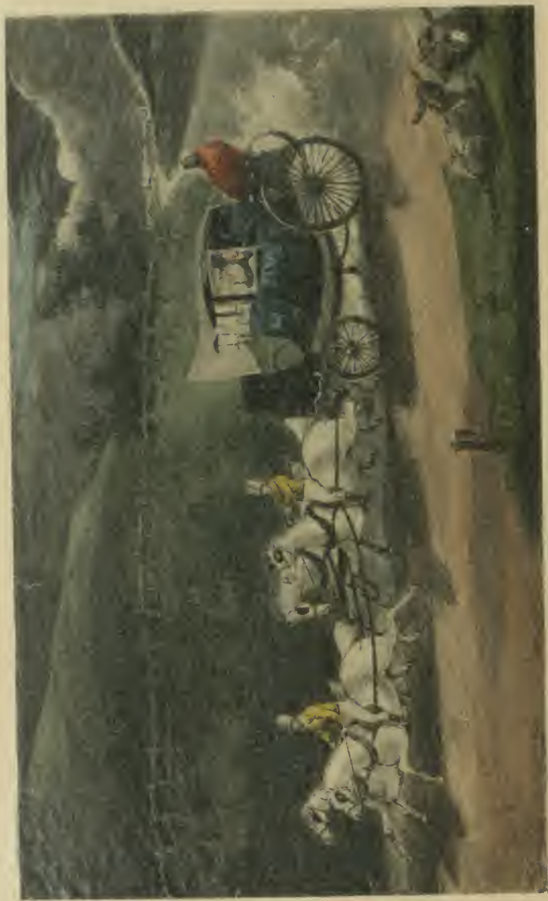
By W. MESSER "TICHL COME' TICHL GO."