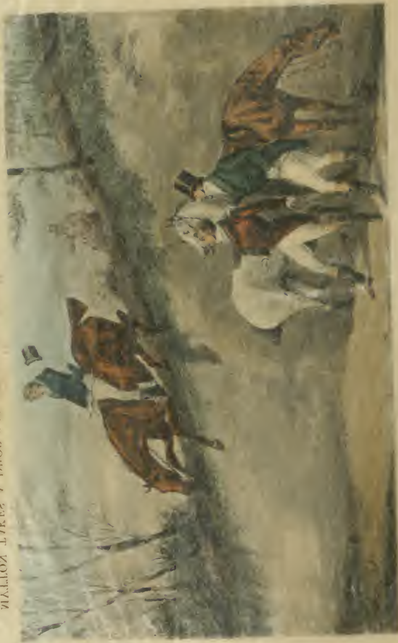
ВЪ И ЧЛЕНА ИЛЛЮСТРАЦИЯ КЪ ДРОБЪ "ЪЗ НИЧЪ 72 У ПОНЪЕ"