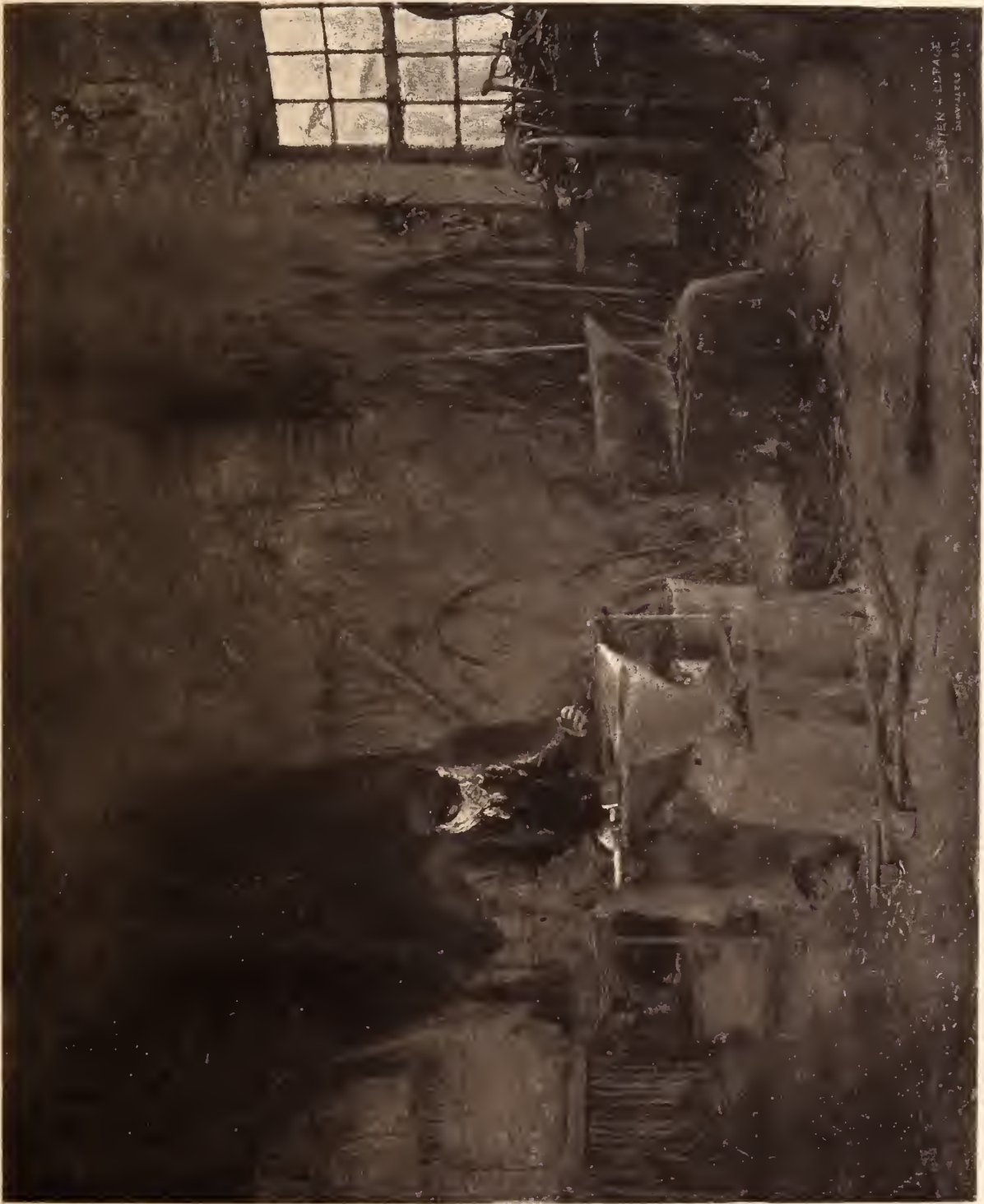
LESTEN - LUTAGE S. 1000000 100