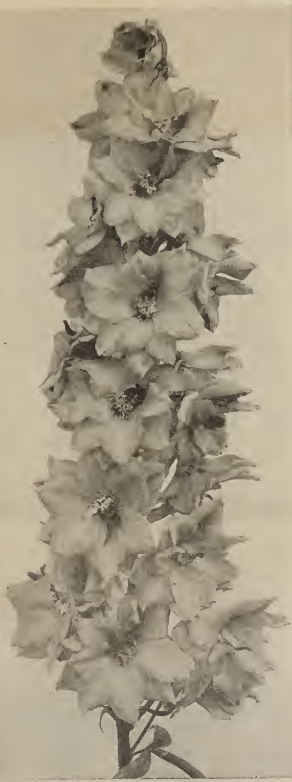
Branch Lateral of Shaw Strain Delphinium

From three-inch pots, varieties No. 249, $2.50 per dozen; $18.00 per hundred. No. 250 to No. 265, $1.50 per dozen; $11.00 per hundred. No. 266 to No. 275, $1.25 per dozen; $9.00 per hundred. Small Delphinium plants shipped express, charges C. O. D. We cannot be responsible for any green plants shipped by us by express or parcel post, as plants leave our hands and are packed in the best way possible, but due to careless handling of railway and postal employees, delays, conditions that cause plants to sweat thereby causing their loss. All green plants shipped are entirely at the purchasers risk.