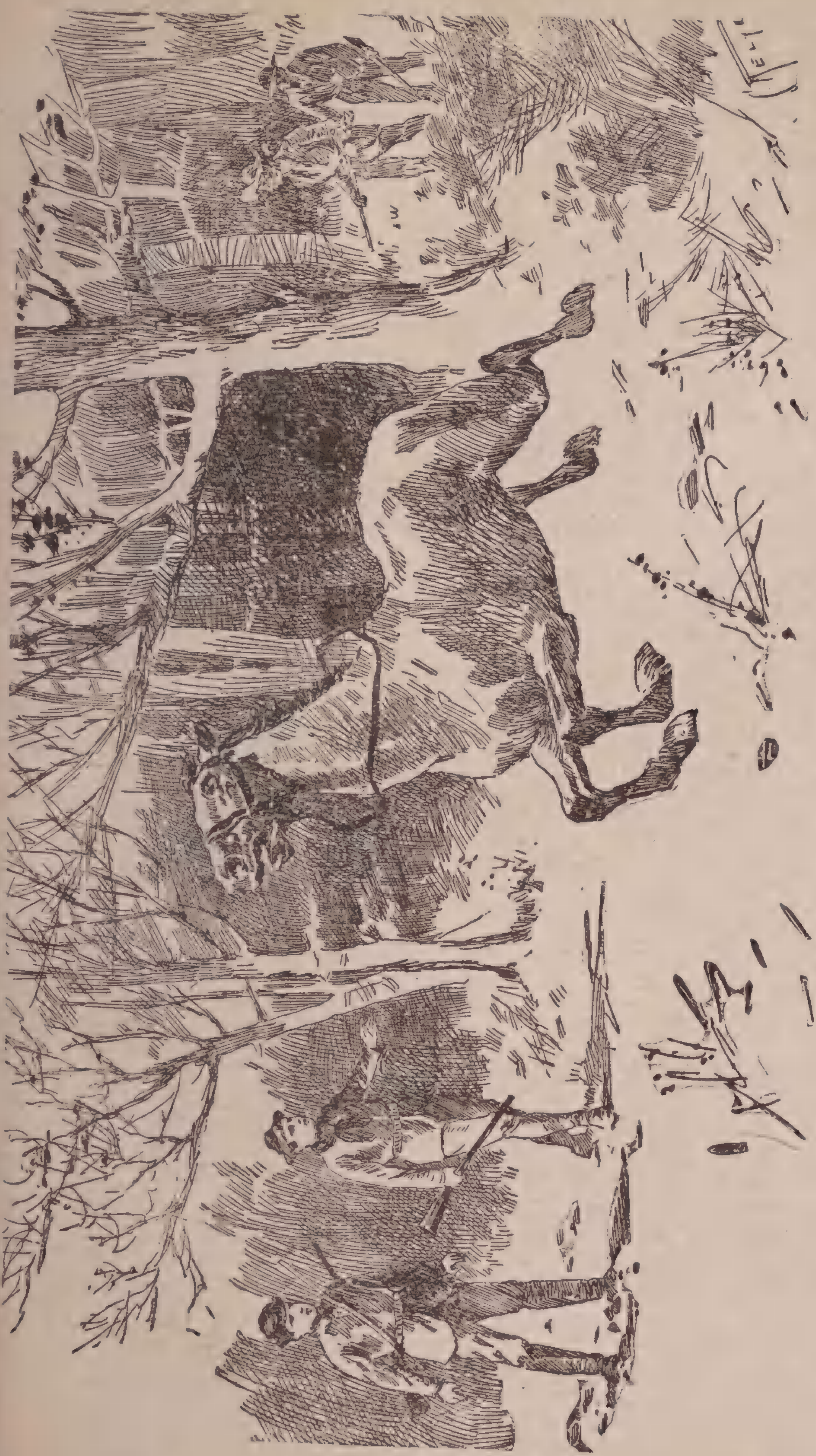
LOAFER CAME BOUNDING OUT OF THE TIMBER.