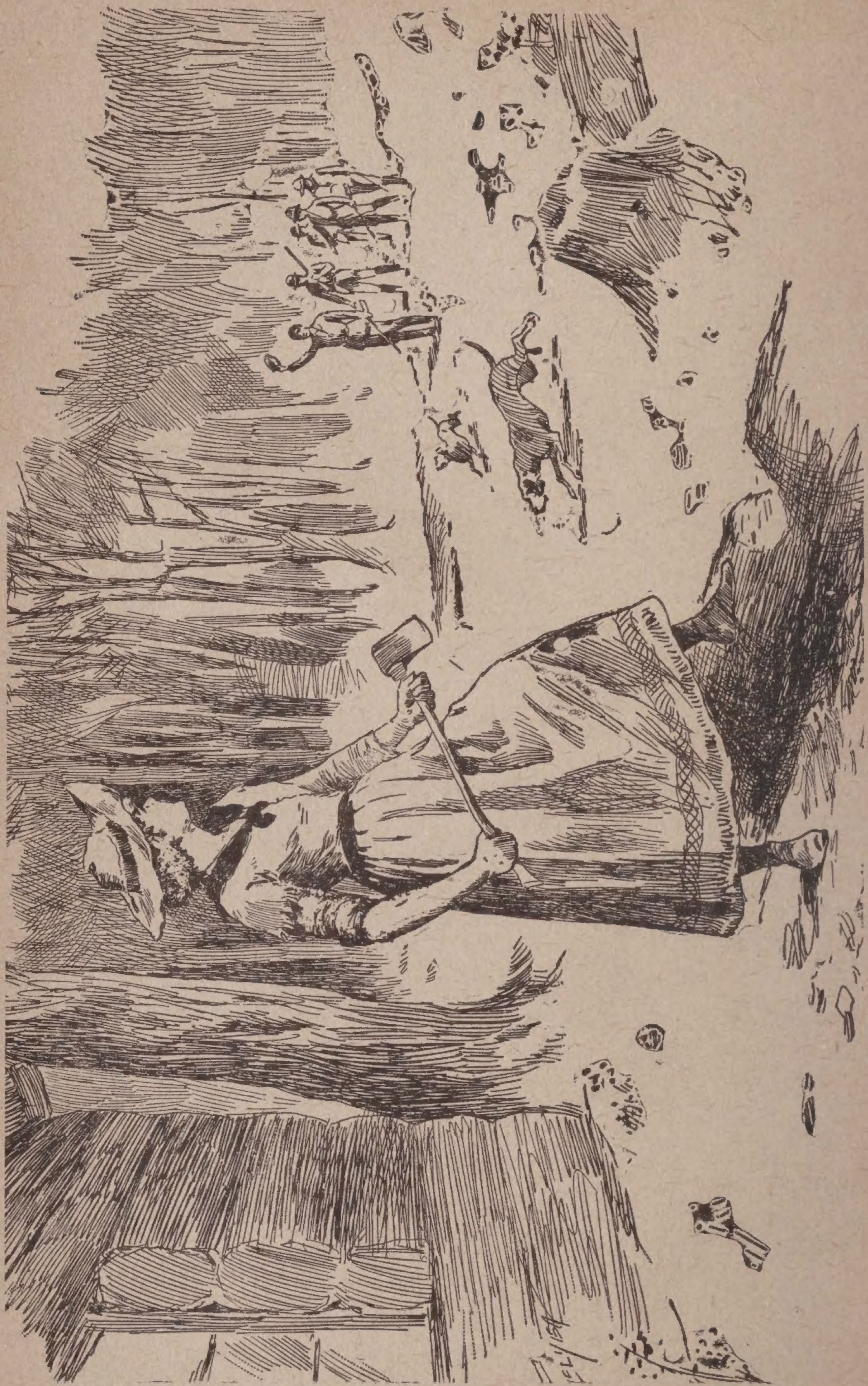
PLYING THE AXE, WAS A TRIM LITTLE FIGURE IN LEATHER AND VELVET.