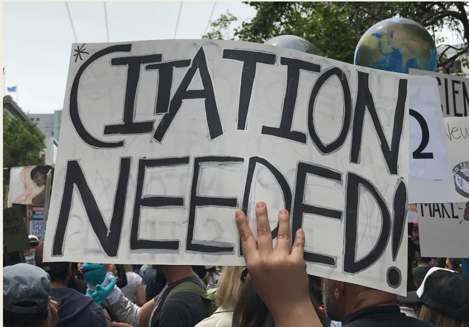
March for Science , San Francisco, 2017.