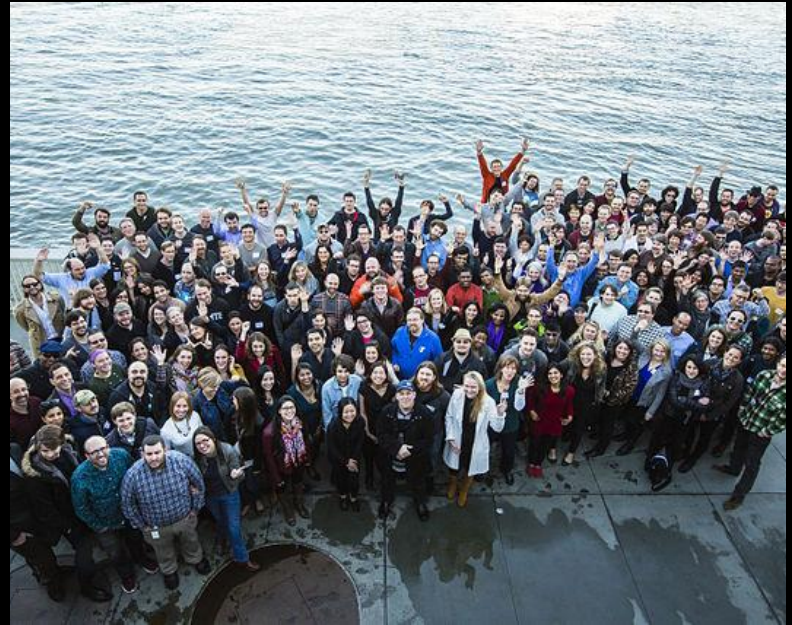
Wikimedia staff in 2015.