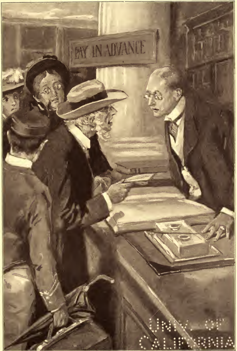
He showed 'em in a careless way as much as fifteen dollars in cash.—Page 70.