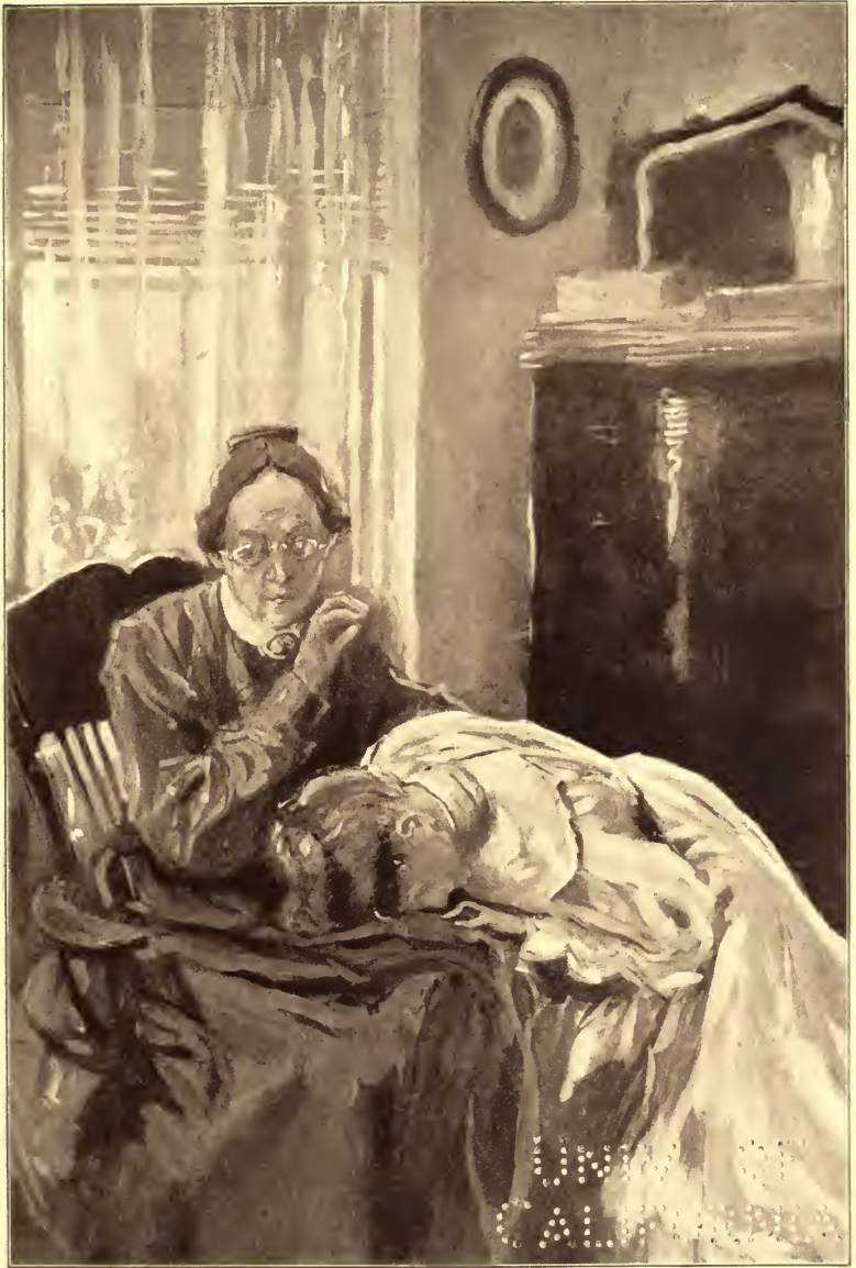
She laid her pretty head in my lap, sobbin' out, "What shall I do? What shall I do?"—Page 214.