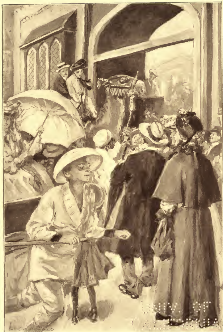
It is the big crowd that is surgin' through the Pike to and fro, fro and to.—Page 187.