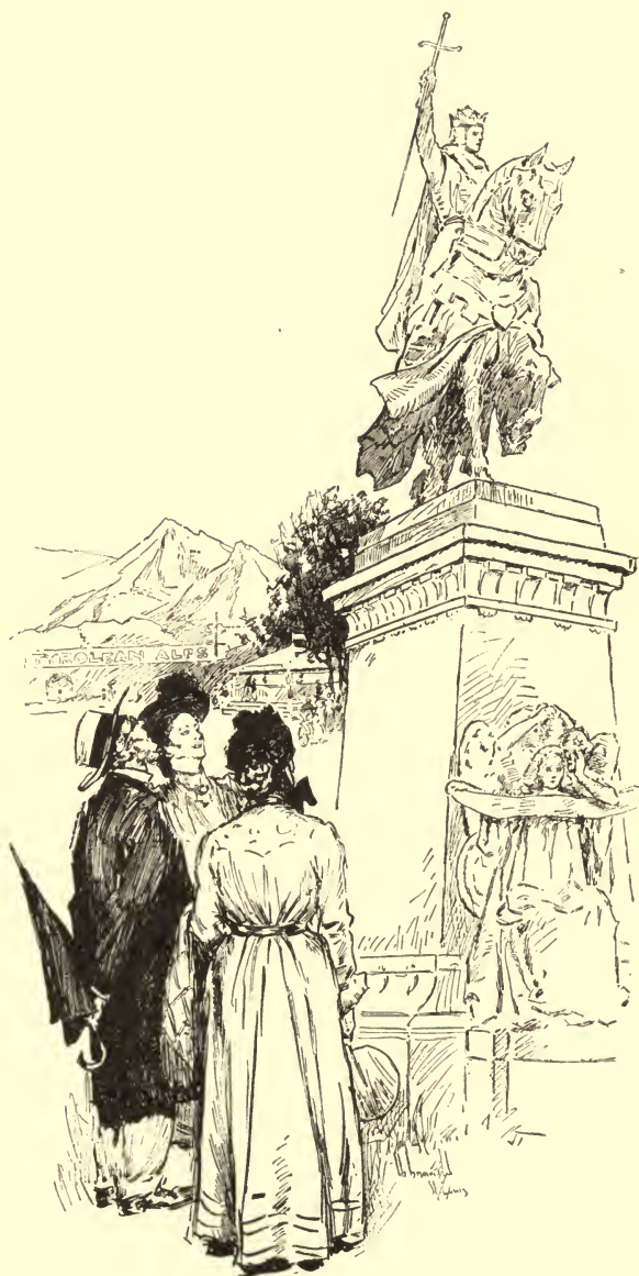
“ Right in the center sets Saint Louis himself on a prancin’ horse, holdin’ up a cross ”