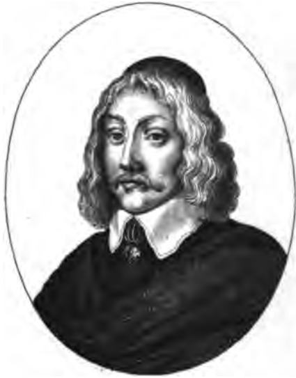
Philip Wharton, Lord Wharton, of Wharton,

Published 1818 by R. Richardson, York House, Strand.