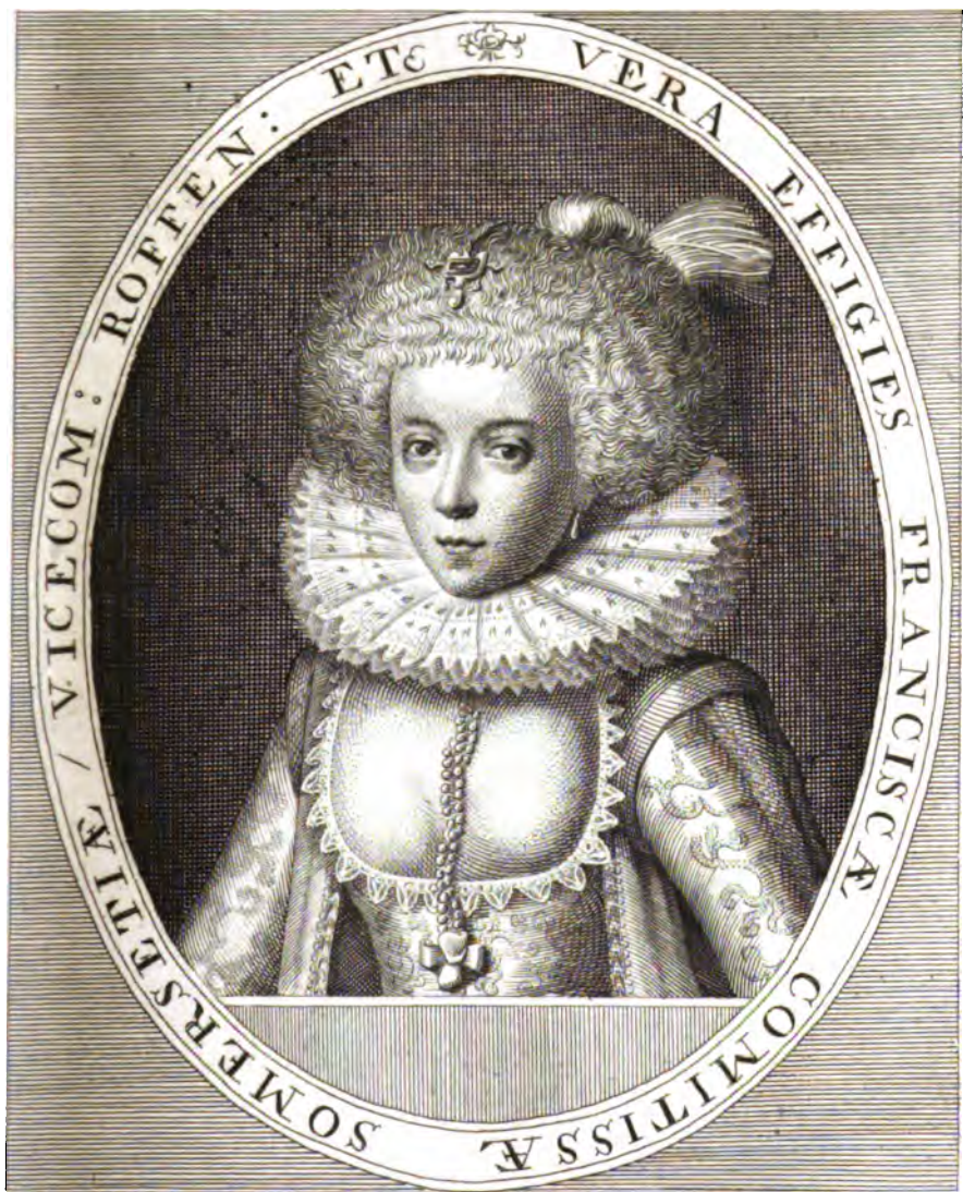
The lively portraict of the Lady Francis Countesse of Somersset