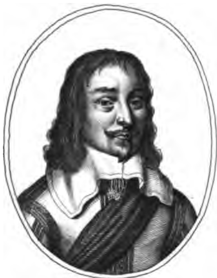
Henry Gray Earle of Stamford, Lord Gray of Groby, Bonvile and Harington etc.