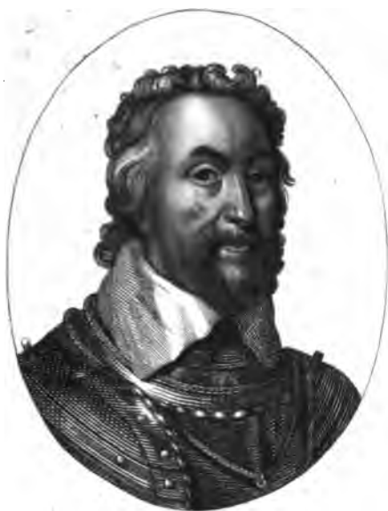
Thomas Earle of Arundell & Surrey; Earle Marshall, & Lord high Steward of England, etc.