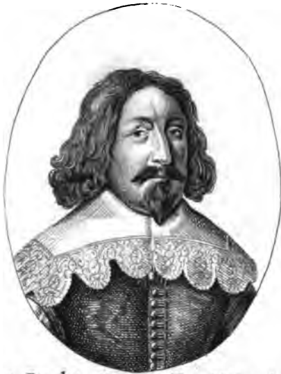
John Pawlet Marquess of Winchester Earle of Wiltshire and Lord St John of Basing.