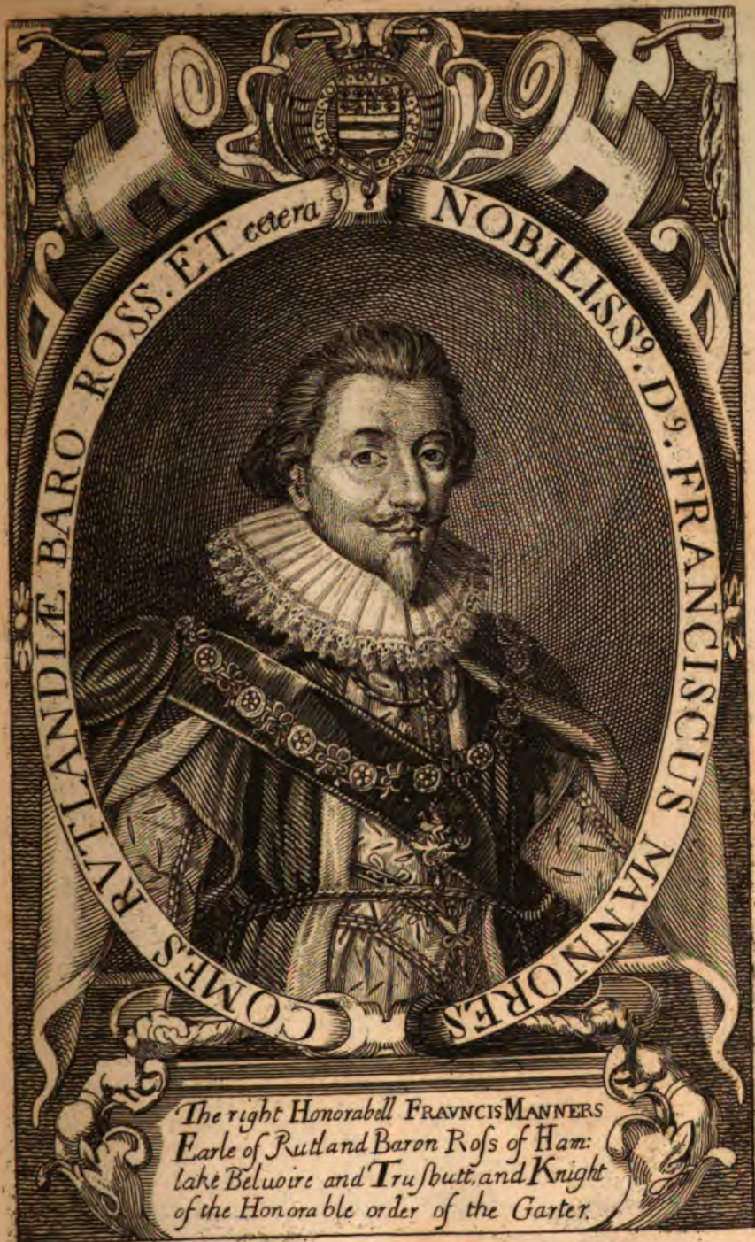
The right Honorabell FRANCIS MANNERS Earle of Rutland Baron Ross of Ham: lake Beluwire and Trusbut, and Knight of the Honorable order of the Garter.