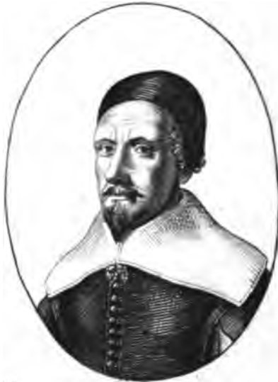
William Seymour, Marquis and Earle of Hartford, and Baron Beauchamp.