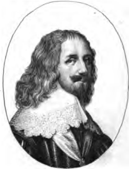
Philipp Herbert Earle of Pem- broke and Montgomery etc Lord Chamberlaine of his M ty most hon ty houfhold