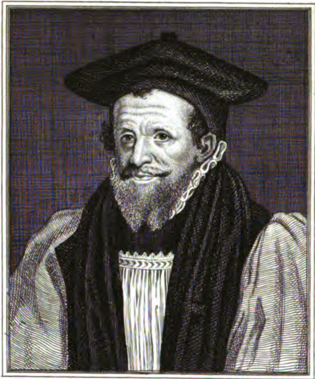
The Rev. Richard Bancroft, ARCHBISHOP of CANTERBURY.