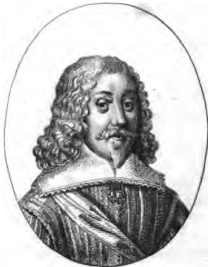
Mildmay Fane Earle of Westmer land Lord le De Spencer and Burghwash