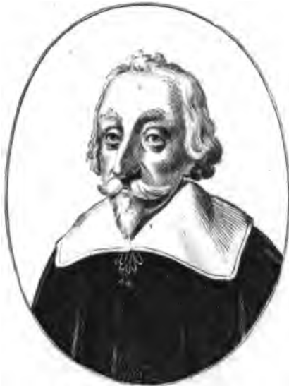
William Finis Viscount Sey and Seale. Lord Sey and Seale.