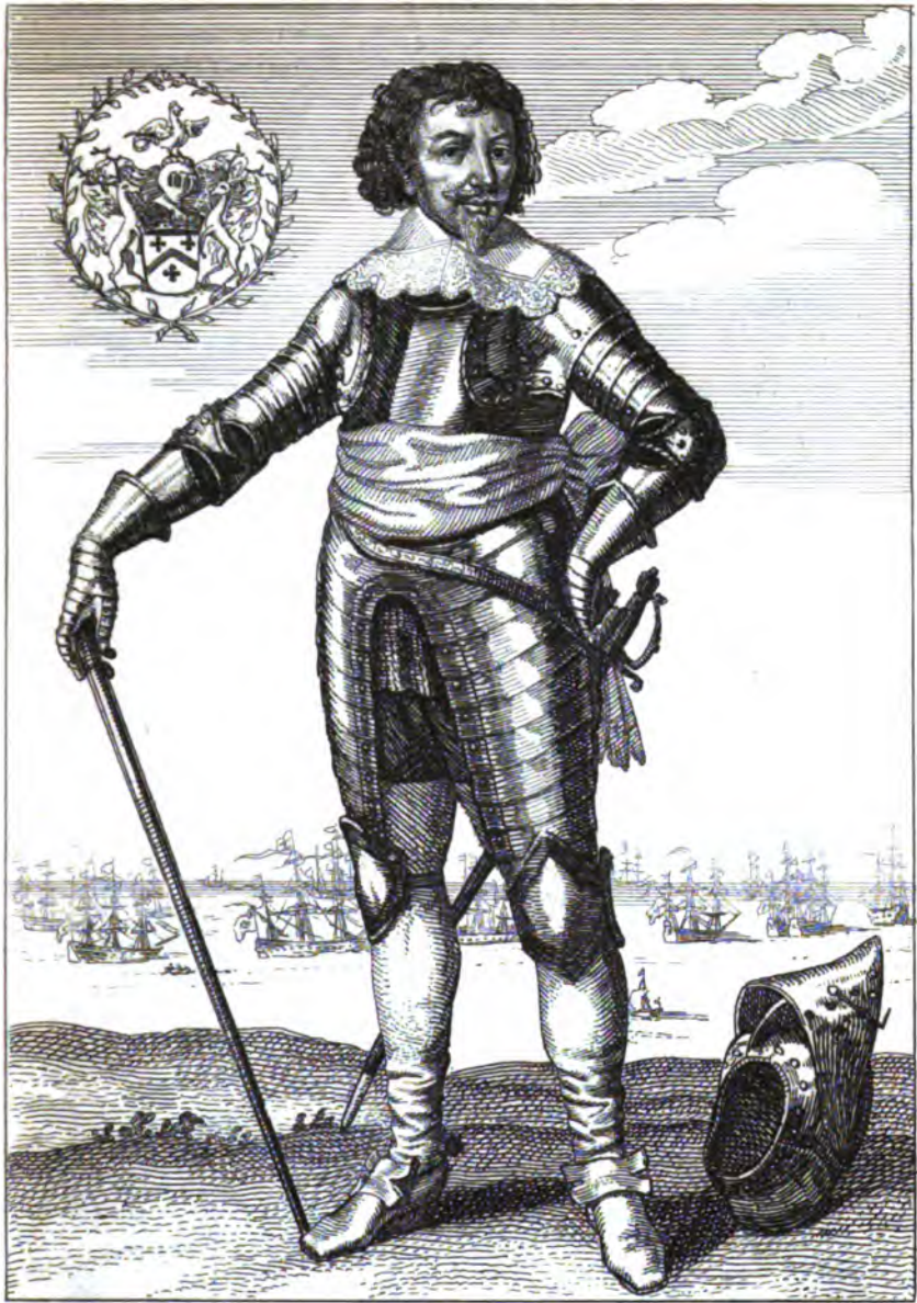
THE RIGHT HONOURABLE ROBERT EARL OF WARWICK, Baron of Leeze, &c. Lord High Admiral of England, one of his Majesty's most honourable Privy Council, and his Majesty's Lieutenant of the Counties of Norfolk, Elsex, &c.