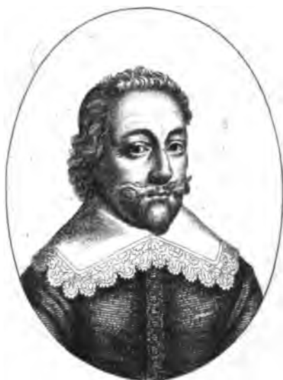
Francis Coffington Lord Coffington of Hanworth. M. of the Court of Wards. Chancellor of the Exchequer: