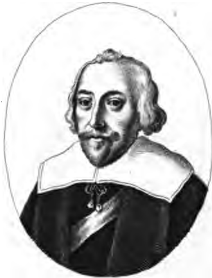
Oliver S t Iohn Earle of Bulling brooke Lord S t Iohn of Bleifo