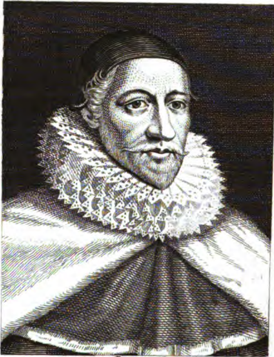
The Honourable S r JAMES SEY Knight and Baronett Lord Cheife Iustice of The Kings Bench &c.