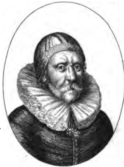
Lionell Cranfield. Earle of Middlesex. Baron Cranfield of Cranfield.