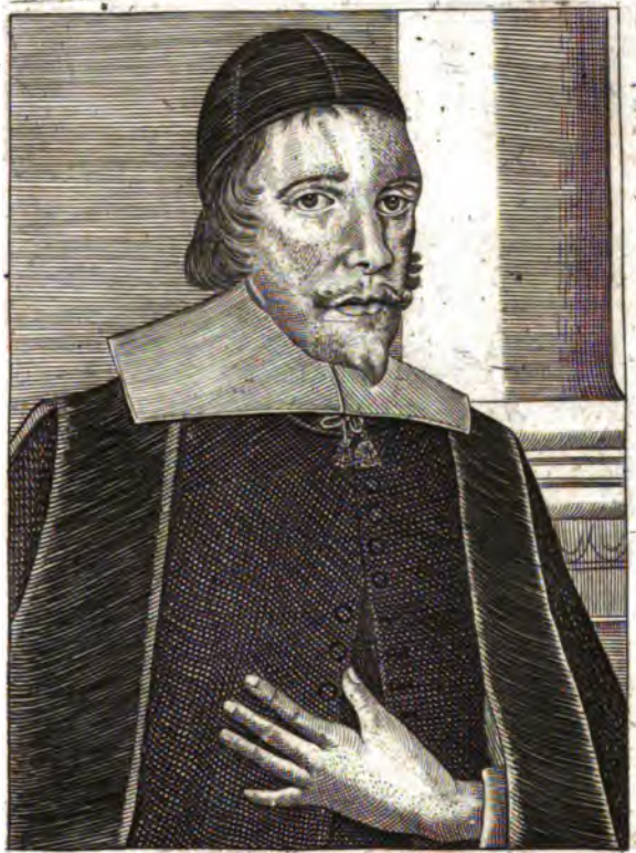
JEREMIAH BURROUGHES Late Gospell = Preacher To two of the Greatest Congregations in England viz Stepnay and Cripplegate London.