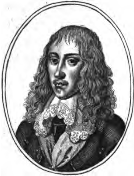
The Illustrious & High-borne Prin- cé Rupert Count Palatine of y e Rhe- ne & Knight of the most noble Order of the Garter & Generall of the Horse to his Ma ty King Charles 1 st 1643