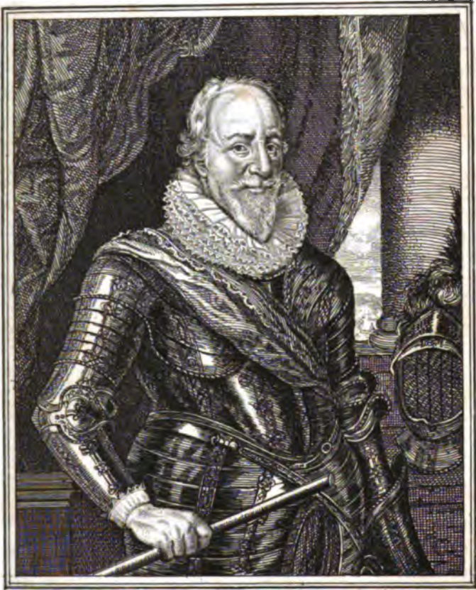
GEORGE CAREW, EARL OF TOTNES.