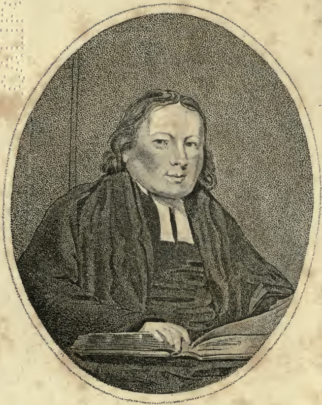
The Rev. Tho. Coke, D.D.