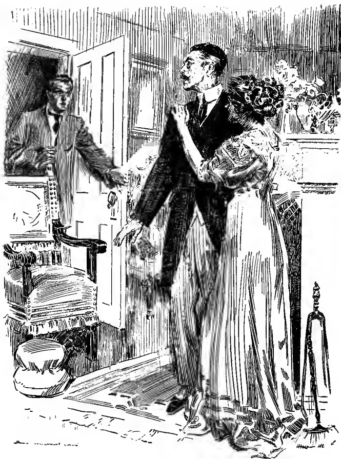
THE DOOR OPENED AND DALE KYNNERSLEY BURST, UNANNOUNCED, INTO THE ROOM.