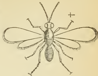
FIG. 1.—Egg-parasite of the Hessian Fly.

It is shining black; the head is finely punctured, rounded, and slightly broader than long, being about as wide as the thorax. The antennae are about as long as the head and thorax; they are slender, but apparently a little stouter than in P. error , the penultimate joints being a little broader and squarer than he represents (and they are very different from Platygaster tipulae ), these joints not being "twice as long as thick," but only \frac{1}{4} to \frac{1}{3} longer, much as represented by Fitch in his figure;* the terminal joint is long, oval, not so wide as those just behind it, and it tapers to a