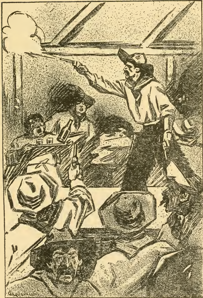
Shooting the Lights Out. (Page 291.)