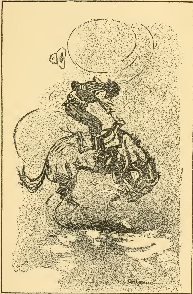
A TENDERFOOT'S FIRST RIDE.