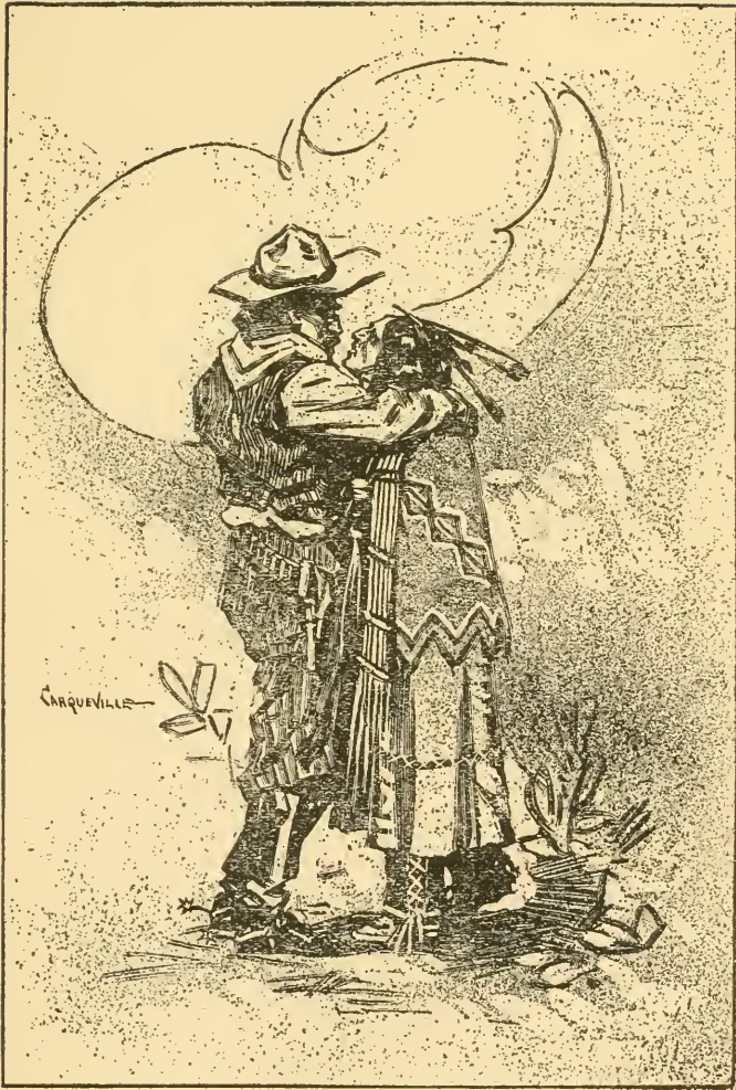
JOHN BLACK AND JENNE. (Page 64.)