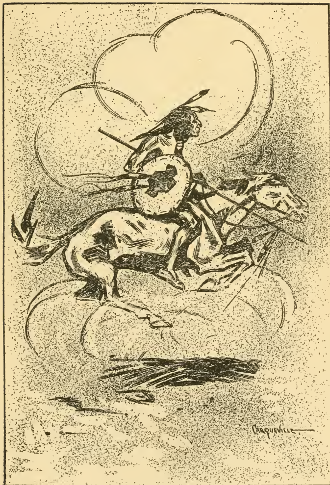
INDIAN COURIER. (Page 56.)