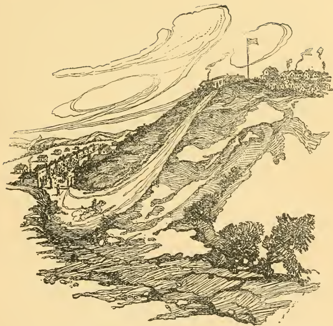
FORT GRIFFIN IN 1876.