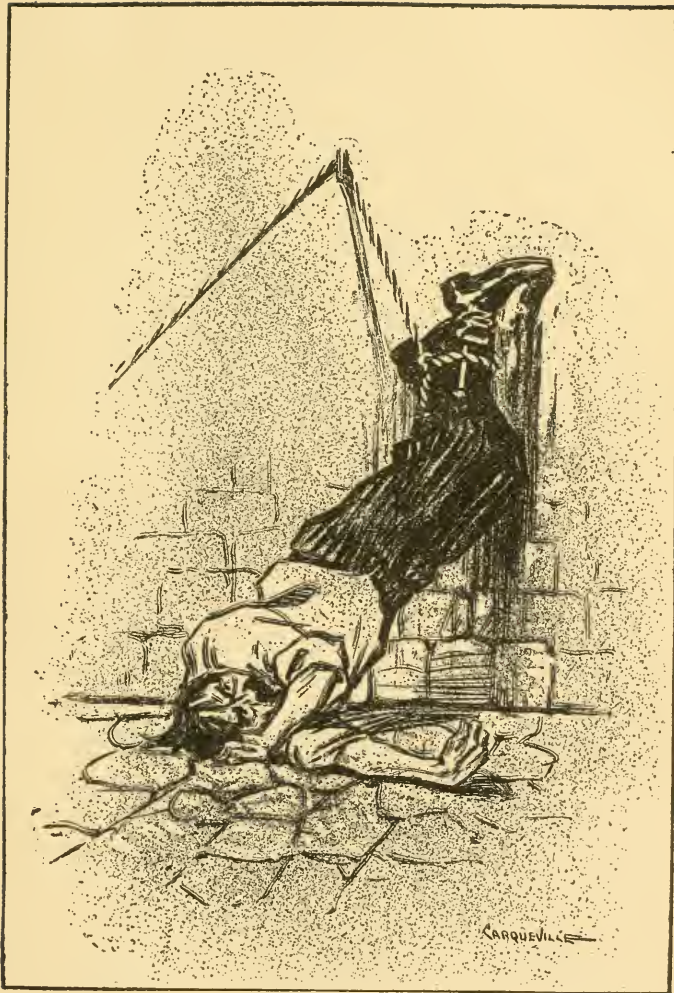
“Had him trussed up like a chicken.” (Page 78.)