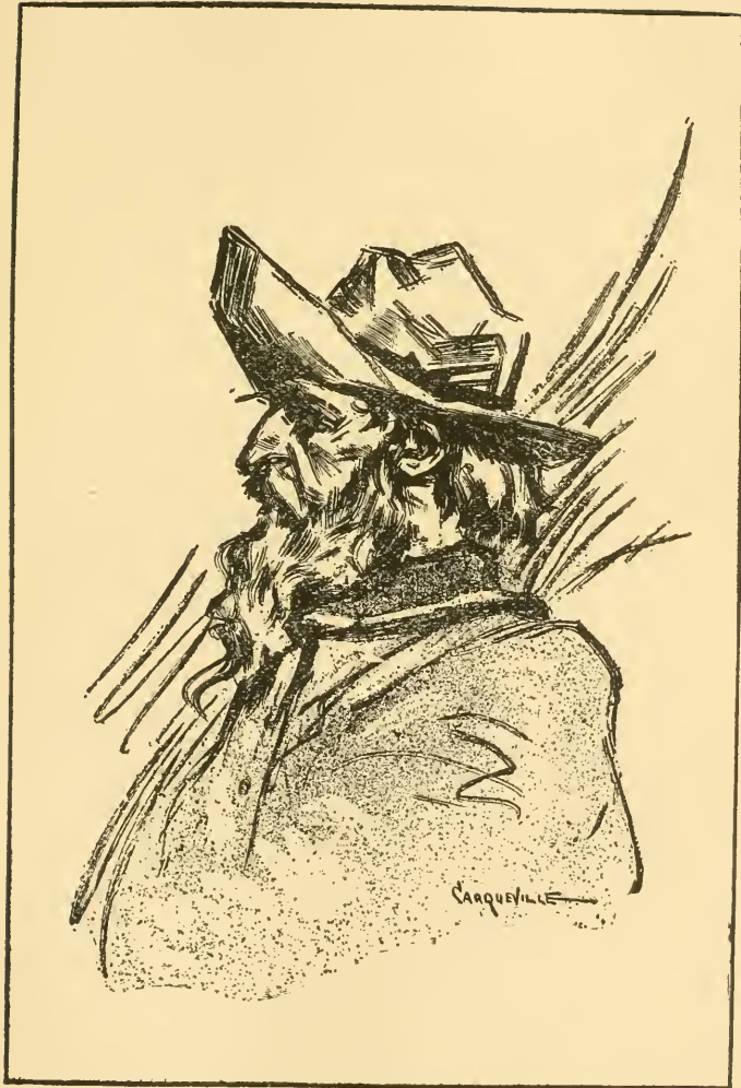
UNCLE GEORGE GREER. (Page 168.)