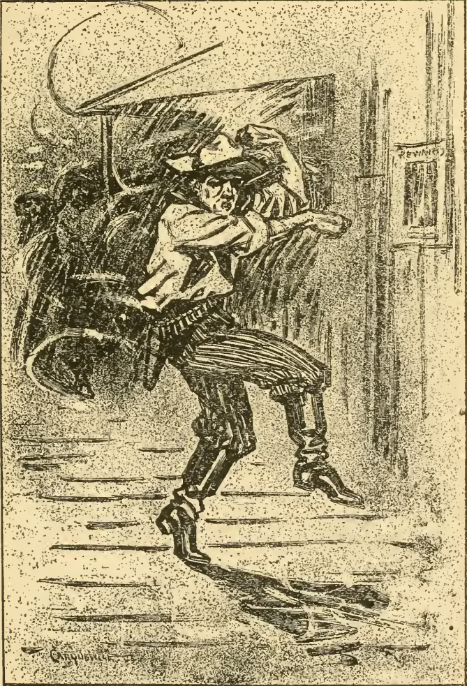
DANCING TO SIX-SHOOTER TIME. (Page 154.)