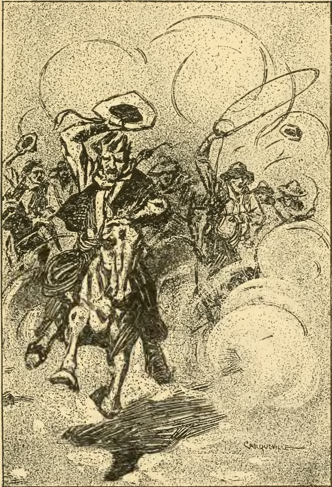
When the cowpunchers came to town. (Page 162.)