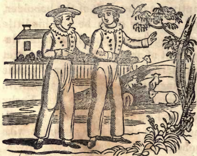
Rambling about the Farm.

rie, where he had seen lions, tigers, a wolf, a spotted panther, a white bear, and other wild beasts.