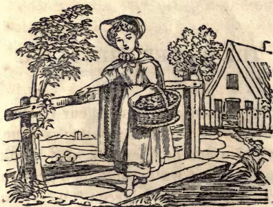
The Water-Cress Girl.

to make the bed, sweep up the hearth, and draw her grandmother's elbow chair into the warmth of the sun, that she might sit there in ease, till her return from the houses where she was in the habit of calling with her basket of water-cresses; and as Susan was known to be such a good girl, she did not want for friends, who were always glad to buy of her. A lady, of the name of Meadows, had lately come to reside in the village,