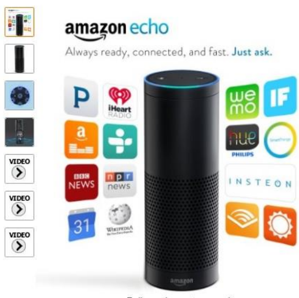
Roll over image to zoom in