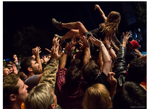
She tries to keep up with all the underground shows throughout the city. 2