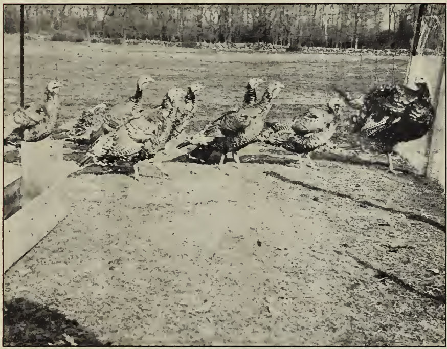
A breeding pen of high quality Bronze on the Ferrycliffe Farm, Bristol, Rhode Island. This farm has long been noted for the high quality of its Bronze among growers on the Eastern seaboard.