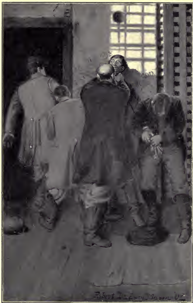
WATSON PLACED HIS HAND OVER THE MAN'S MOUTH