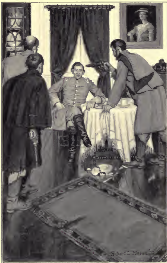
THE MAJOR MERELY CHANGED THE POSITION OF HIS LEGS