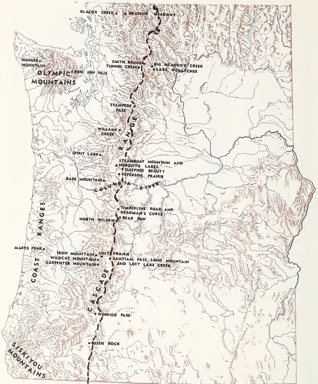
Figure 1.—Geographic distribution of cone production study plots.