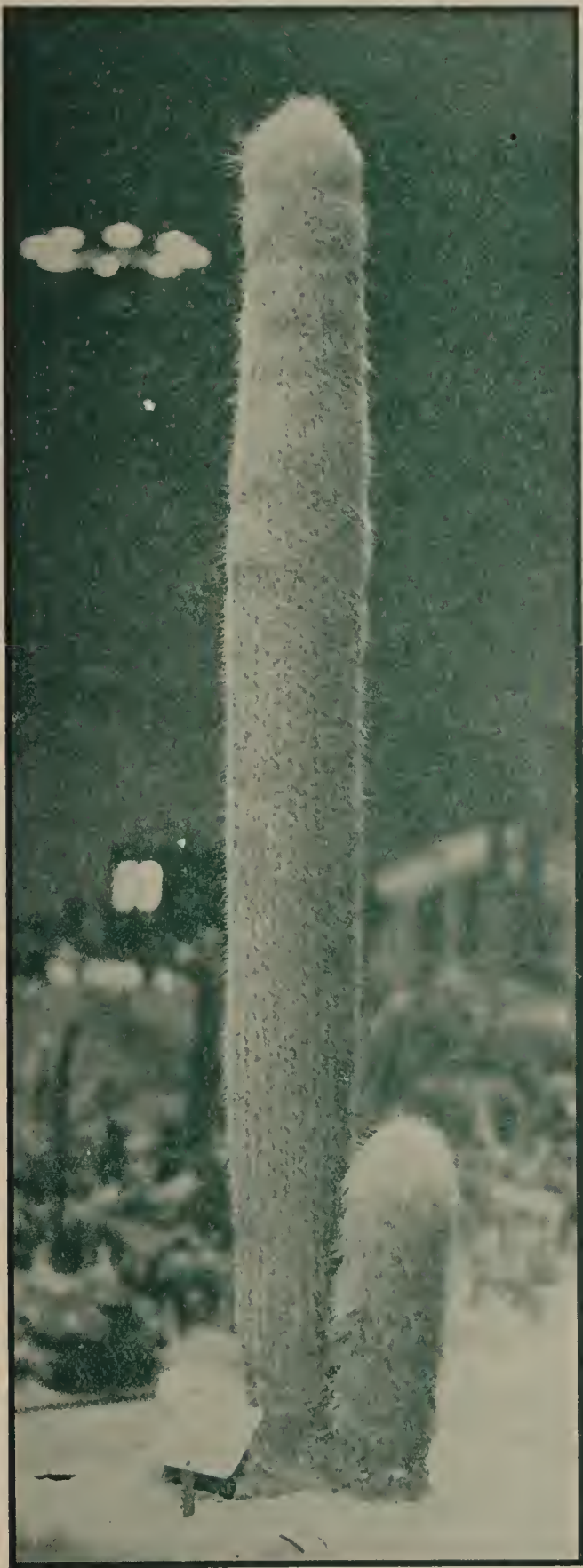
CEPHALOCEREUS SENILIS The Old Man of Mexico

The Cephalocerei are usually tall plants with long hairs or wool on them.