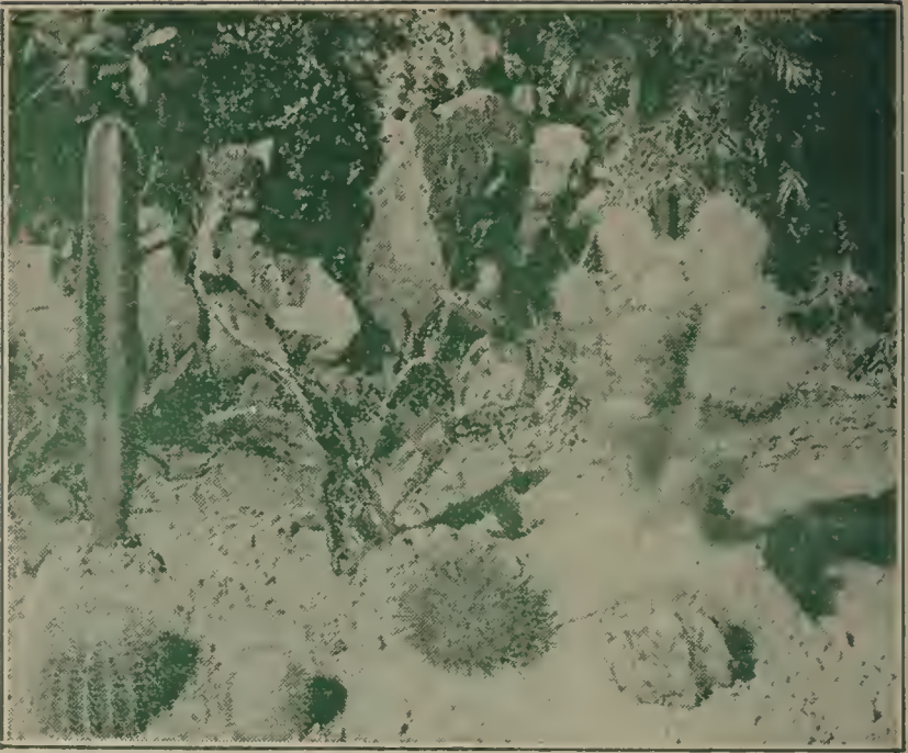
Upper row, left to right: Cereus peruvianus , Opuntia monacantha variegata , Opuntia bigelovi ; lower row: Echinocactus gusoni , Neomammillaria geminispina , Ferocactus acanthodes , Astrophytum ornatum .