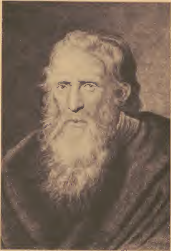
OLD PARR At the age of 152 Years