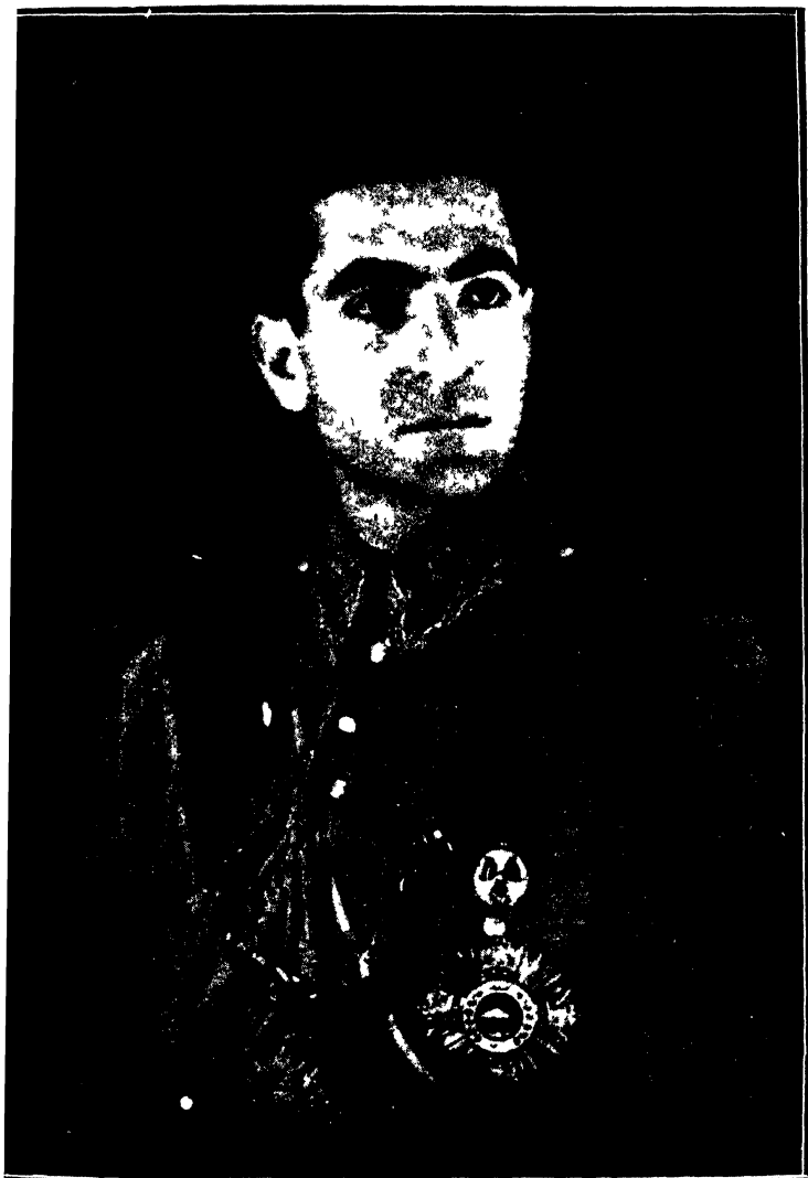
The Shahinshah Of Iran.