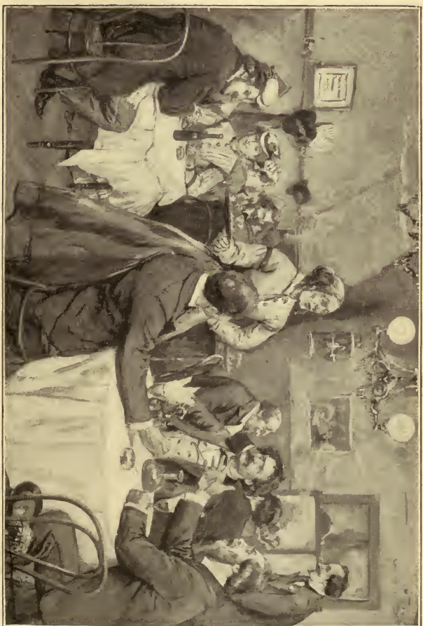
THE DAME LOOKED PERPLEXED