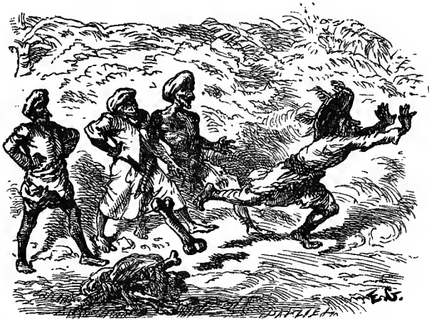
The bone thereupon stood upright, and hopped about.

Then they determined to return home. As with beating hearts they approached the old city, their birth-place, and gazed with moistened eyes upon its tall spires and grim pagodas, its verdant meads and venerable groves, they saw a Kanjar, 1 who, having tied up in a bundle the skin and bones of a tiger which he had found dead, was about to go on his way. Then said the thief to the gambler, "Take we these remains with us, and by means of them prove the truth of our science before the people of Gaur, to the offence of their noses." 2 Being