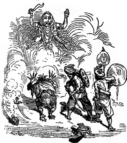
As he bent him down to salute the goddess.

At last the brilliant god, Indra himself, with the thousand eyes, rising from the shade of the Parigat tree, the fragrance of whose flowers fills the heavens, appeared in his car drawn by yellow steeds and cleaving the thick vapours which surround the earth—whilst his attendants sounded the heavenly drums and rained a shower of