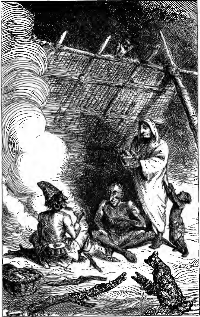
The householder's wife came to serve up the food, rice and split peas ( to face p. 154 ).