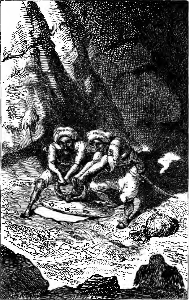
The two then raised, by their united efforts, a heavy trap-door ( to face p. 132 ).