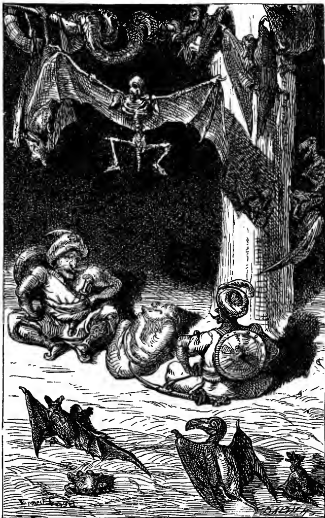
Vikram placed his hundle upon the ground, and seated himself cross-legged before it (to face p. 158).