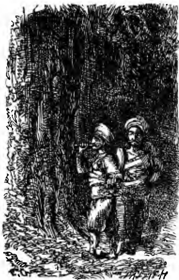
After a few minutes the signal was answered.

After a sharp walk the pair reached a high perpendicular sheet of rock, rising abruptly from a clear space in the jungle, and profusely printed over with vermilion hands. The thief, having walked up to it, and made his obeisance, stooped to the ground, and removed a bunch