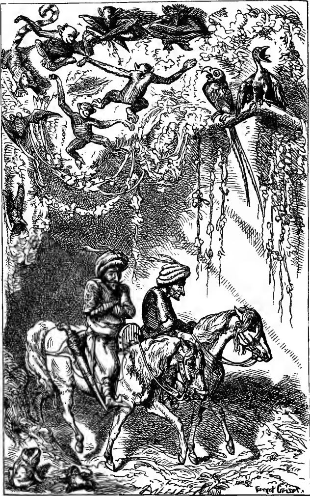
During the three hours of return hardly a word passed between the pair (to face p. 45).