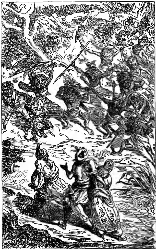
As they emerged upon the plain, they were attacked by the Kiratas (to face p. 211).