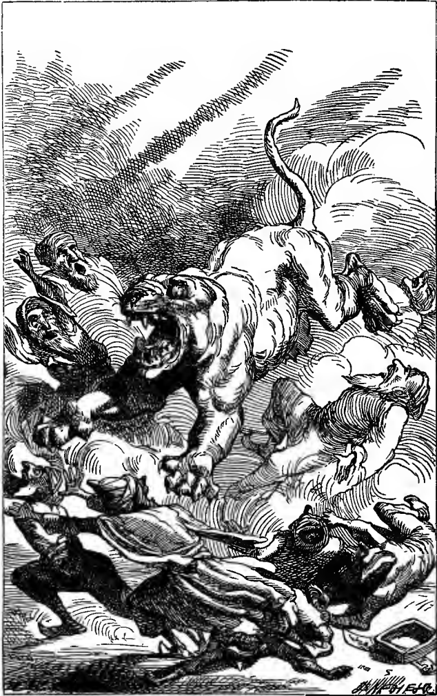
With a roar like thunder (to face p. 179).