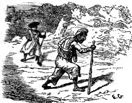
Baman, the second suitor, tied up a bundle and followed

Baman, the second suitor, tied up a bundle of his beloved one's ashes, and followed—somewhat prematurely—the precepts of the great lawgiver Manu. “When the father of a family perceives his muscles becoming flaccid, and his hair grey, and sees the child of his child, let him then take refuge in a forest. Let him take up his conse-