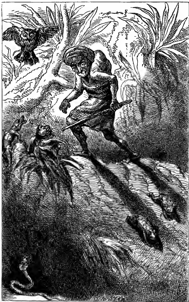
He set out alone with his ill-gotten wealth ( to face p. 89 ).