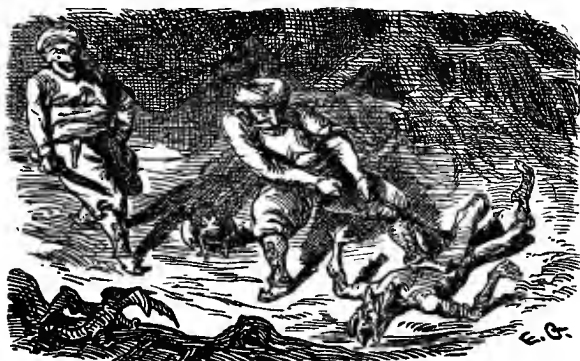
Presently the Demon was trussed up as usual.

Then it struck him as being passing strange that she had begun to love him when the last sand of his life was well nigh run out; that wondrous are the ways of the revolving heavens which bestow wealth upon the niggard that cannot use it, wisdom upon the bad man who will misuse it, a beautiful wife upon the fool who cannot protect her, and fertilizing showers upon the stony hills. And thinking over these things, the gallant and beautiful thief laughed aloud.