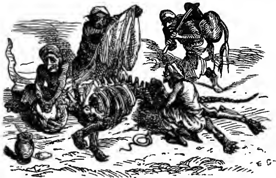
They prepared for their task.

The third drew from his pouch the brain and eyes of