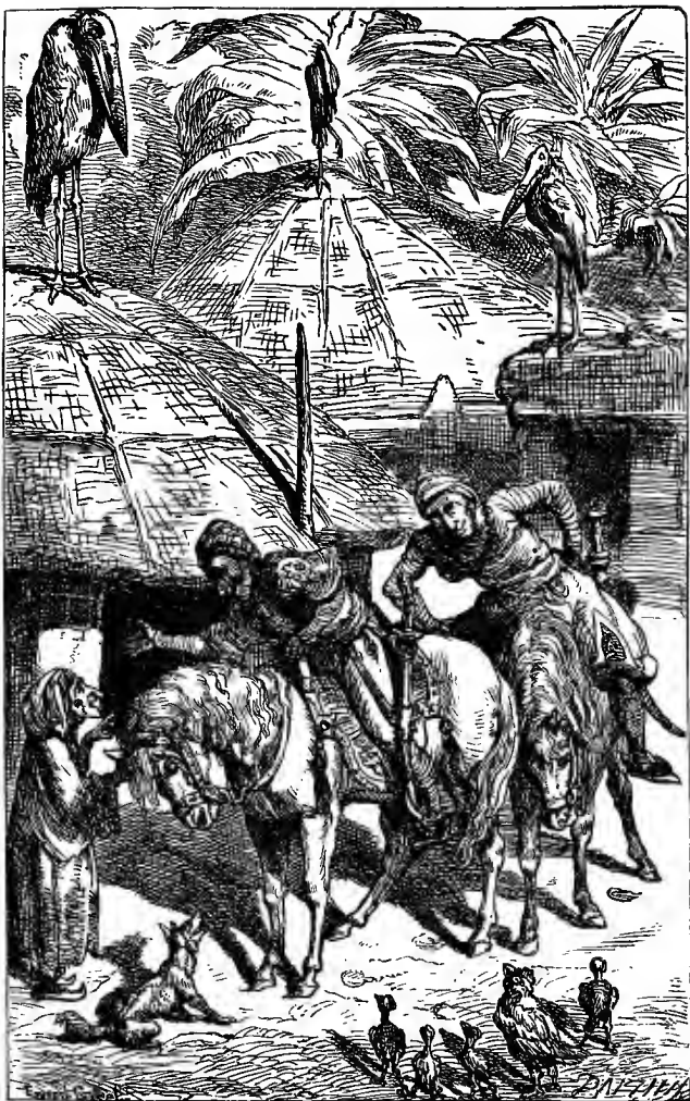
Went up to her with polite salutations (to face p. 49).