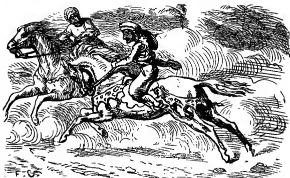
Mounting their horses, followed the party.

In the meantime, the ascetic and his pupil hurrying to the cemetery resumed their proper dresses; they then went to the old nurse's house, rewarded her hospitality till she wept bitterly, girt on their weapons, and mounting their horses, followed the party which issued from the gate of King Dantawat's palace. And it may easily be believed that they found little difficulty in persuading the poor girl to exchange her chance in the wild jungle for the prospect of becoming Vajramukut's wife—lawfully wedded—at Benares. She did not even ask if she was to have a