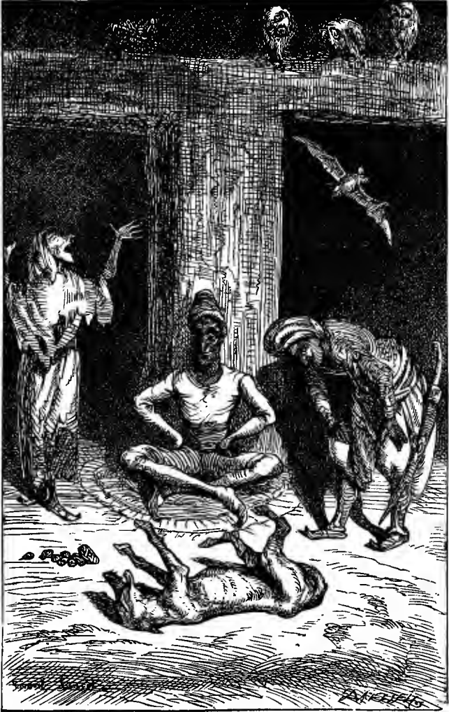
Having said this, he threw one of the sweetmeats to the dog (to face p. 64).