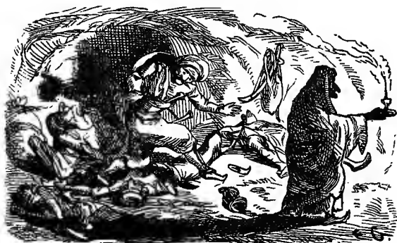
Treading with the foot of a tiger cat.

Then having mentally prepared his measures, the Raja warned a company of archers to hold themselves in readiness for secret service, and as each one of his own people returned from the robbers' cave he had him privily arrested and put to death—because the deceased, it is said, do not, like Baitals, tell tales. About nightfall, when he thought that the thieves, having finished their work of