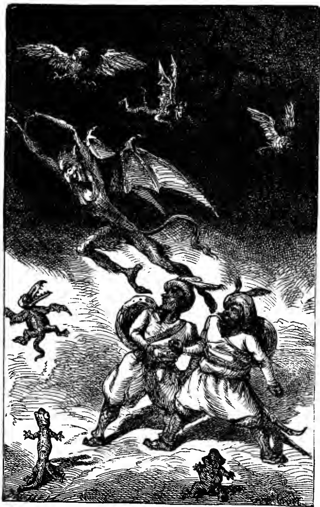
The Baital disappeared through the darkness ( p. 125 ). ( Frontispiece. )