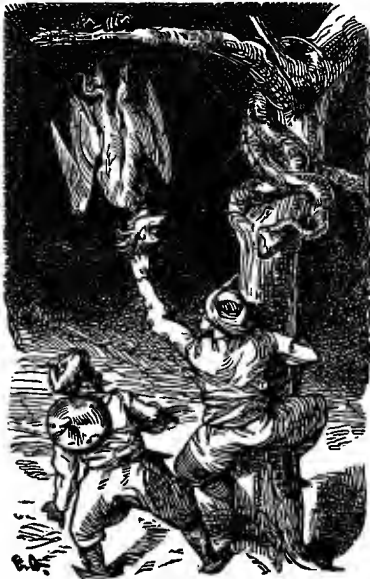
He once more seized the Baital's hair.

“Decidedly this is the young oilman!” exclaimed the Raja, after he had stood for a minute or two with mouth open, gazing upwards and wondering what he should do next. Presently he directed Dharma Dhvaj not to lose an instant in laying hands upon the thing when it next