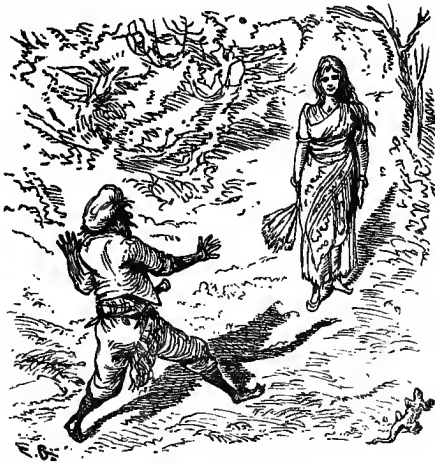
But their eyes had met.

“Nonsense!” exclaimed the warrior king, testily, “I can never believe in that freak of Kama Deva.” He