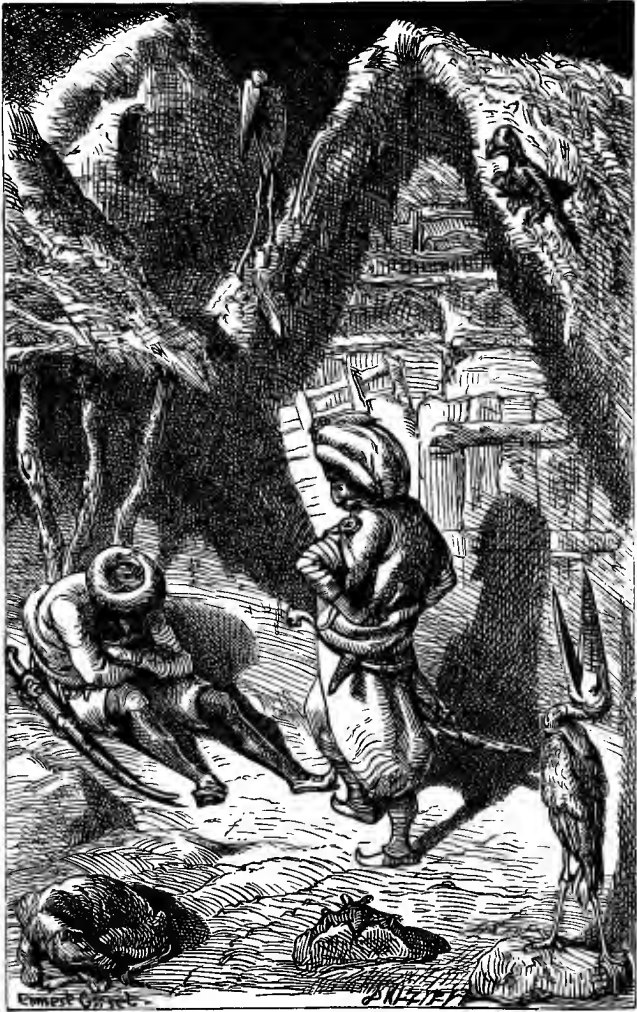
As, however, he passed through a back street . . . (to face p. 129).