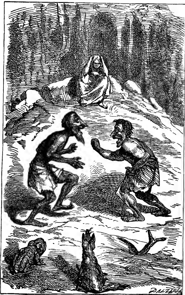
Then a horrid thought flashed across her mind; she perceived her fatal mistake (to face p. 212).