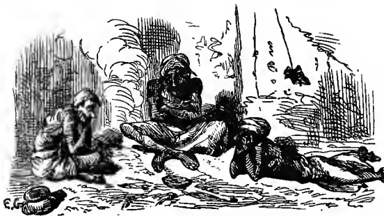
They tried to live without a monthly allowance, and notably they failed.

A month afterwards came the libertine's turn to be disappointed. He could no longer afford fine new clothes; even a well-washed coat was beyond his means. He had