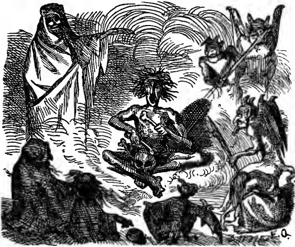
He was playing upon a human skull with two shank bones.

For a moment he thought of the giant's words, "And remember that it is lawful and right to strike off his head