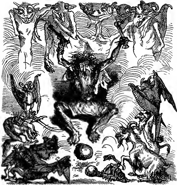
There he found the Jogi.

farewell to the warrior king and to his son. He complimented the former for the last time, in his own way, upon the royal humility and the prodigious self-mortification which he had displayed—qualities, he remarked, which never failed to ensure the proprietor's success in all the worlds.