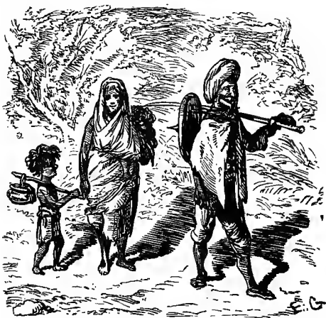
In the meantime a traveller, a Rajput, by name Birbal.

In the meantime a traveller, a Rajput, Birbal by name, hoping to obtain employment, came from the