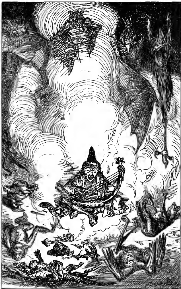
An edifying spectacle, indeed, for the world to see; a cross old man sitting amongst his gallipots and crucibles ( to face page 173 ).