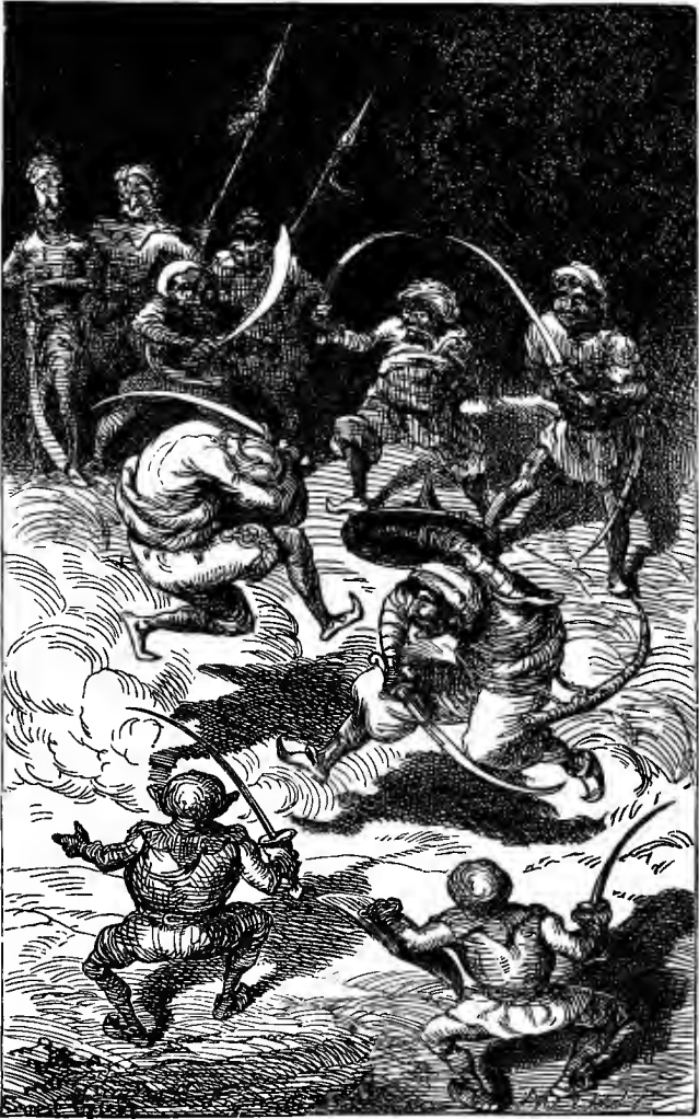
The King was cunning at fence, and so was the thief (to face p. 136).