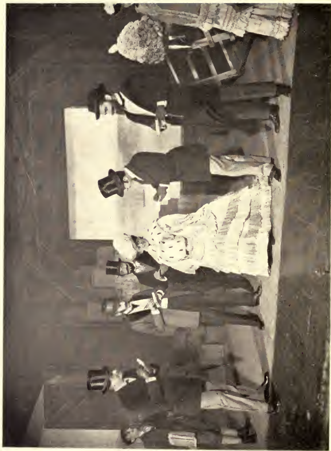
ACRELLA. I'll tell you a secret: I want the big crowd to love me! I want to win the hearts of the gallery boys!