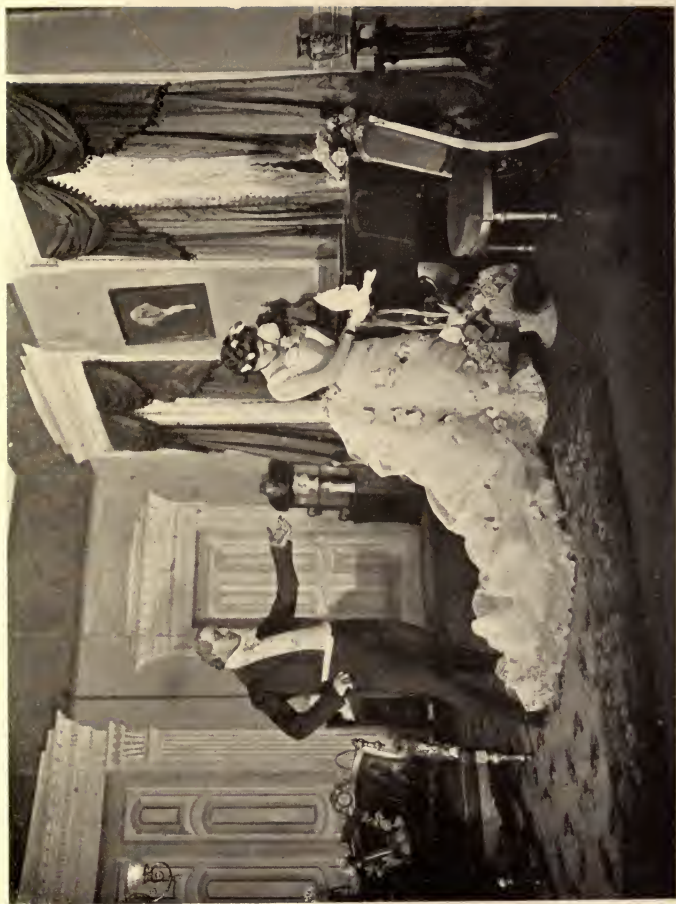
PROFESSOR BELLARTI [ softly ]. Shall I make a little speech for you, dearie, and say you thank them all, and want them to have a happy evening?