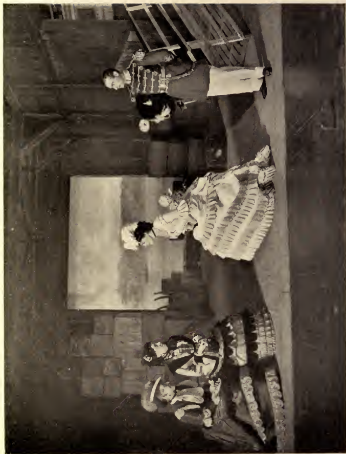
Mrs. STONINGTON. I am told the heroine is a — young person — no better than she should be, in fact not so good.