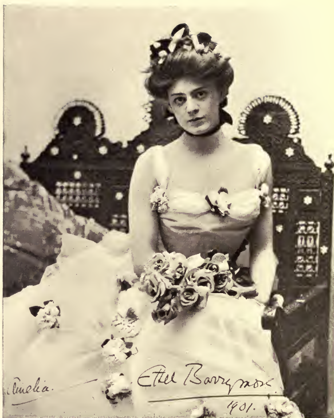
MISS ETHEL BARRYMORE as Aurelia Johnson — "Madame Trentoni"