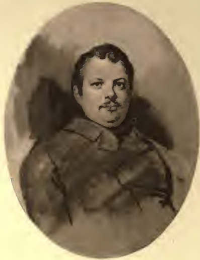
Honoré de Balzac from a sketch in the Museum at Tours.