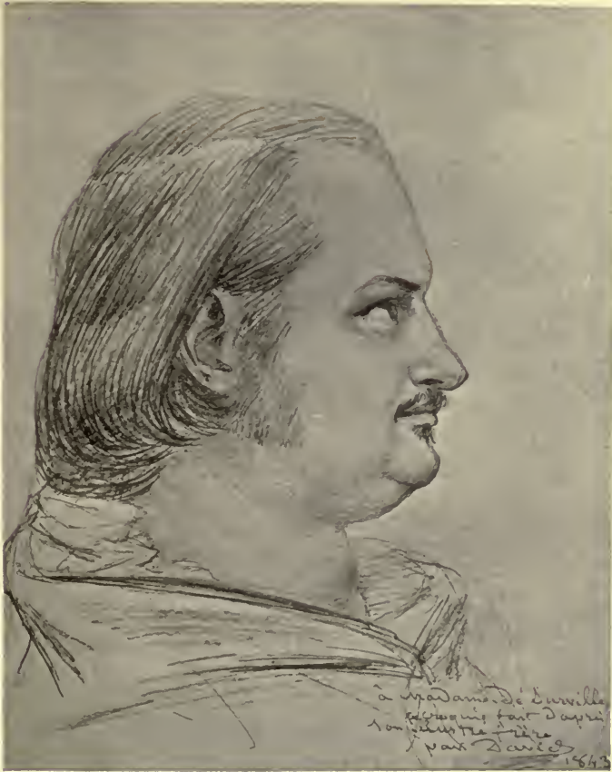
BALZAC, FROM DAVID'S SKETCH