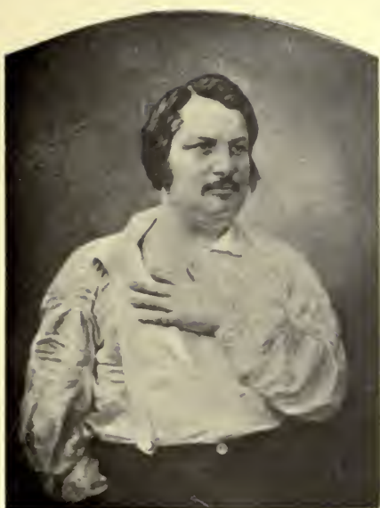
A RARE PORTRAIT OF BALZAC