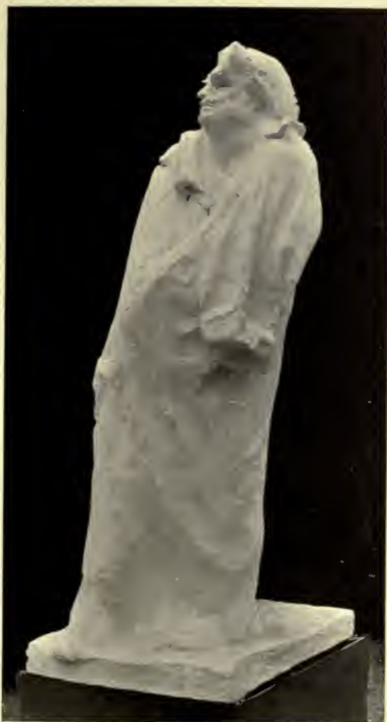
RODIN'S STATUE OF HONORÉ DE BALZAC