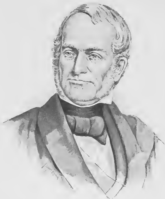
James G. Birney.