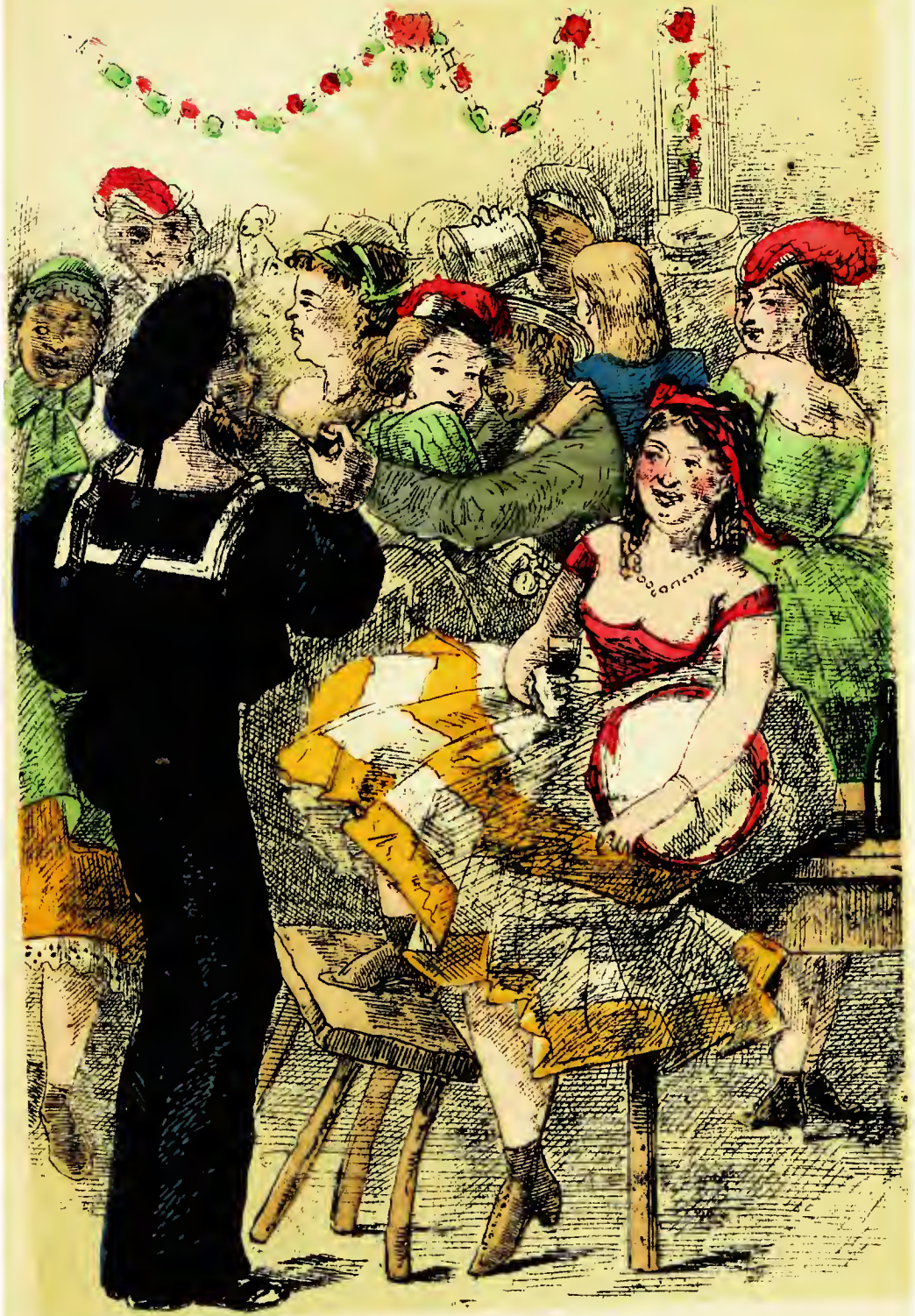
RATCLIFFE HIGHWAY "PADDY'S GOOSE"