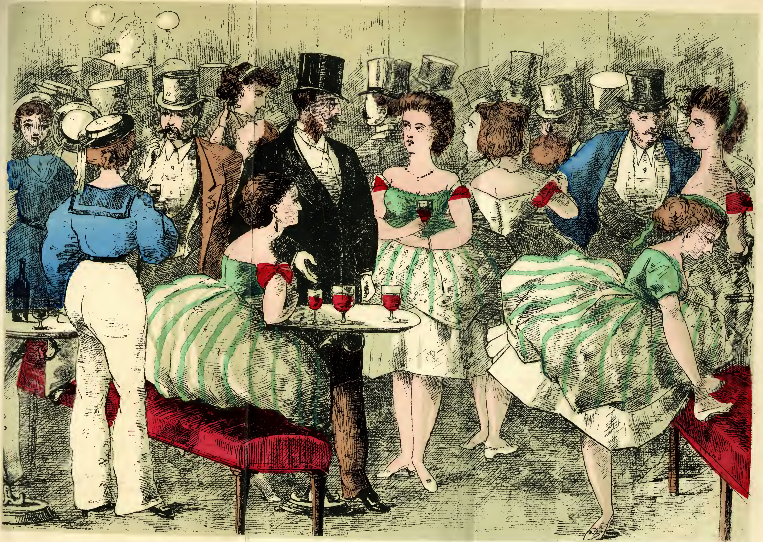
THE ALHAMBRA CANTEEN