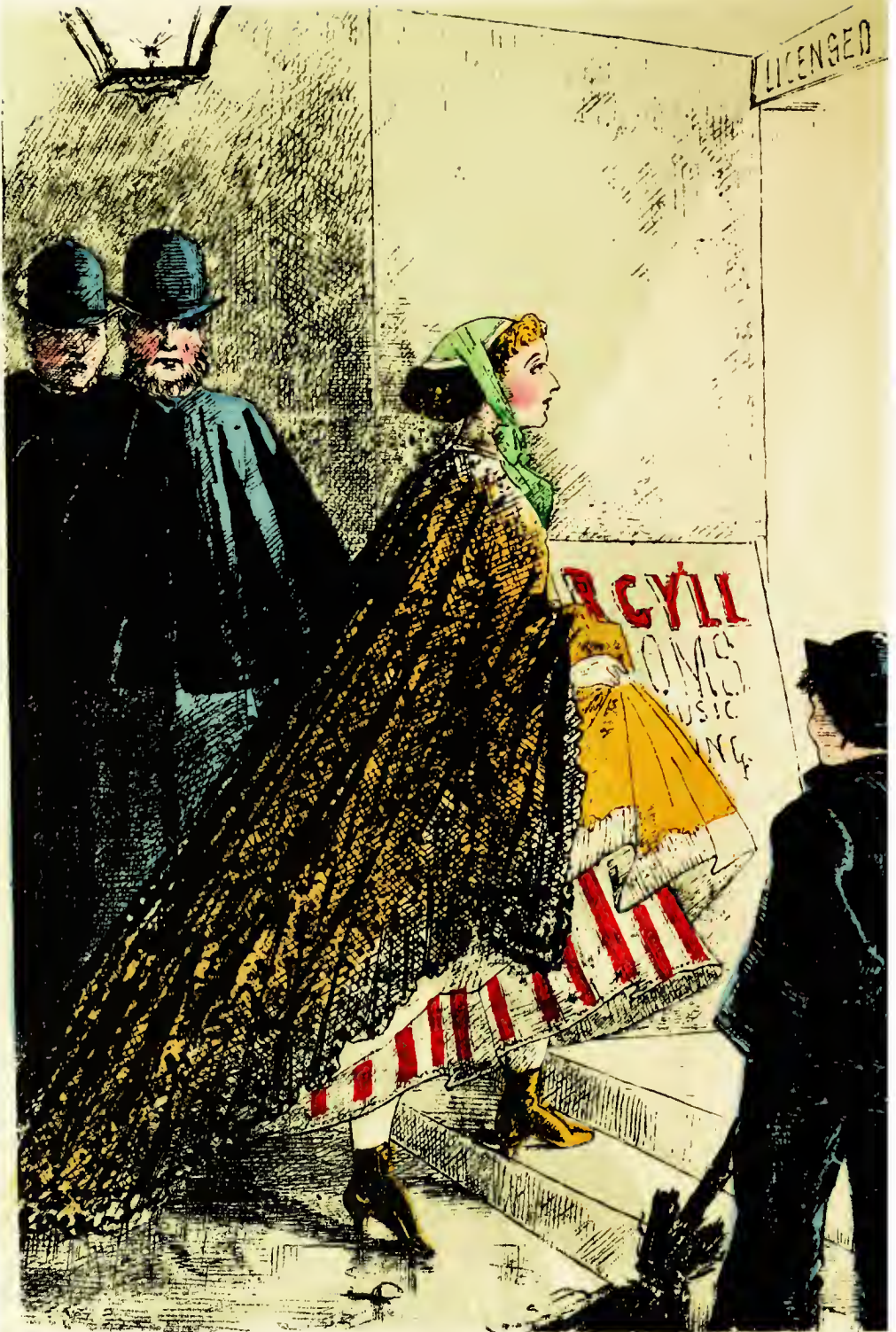
"L O S T"