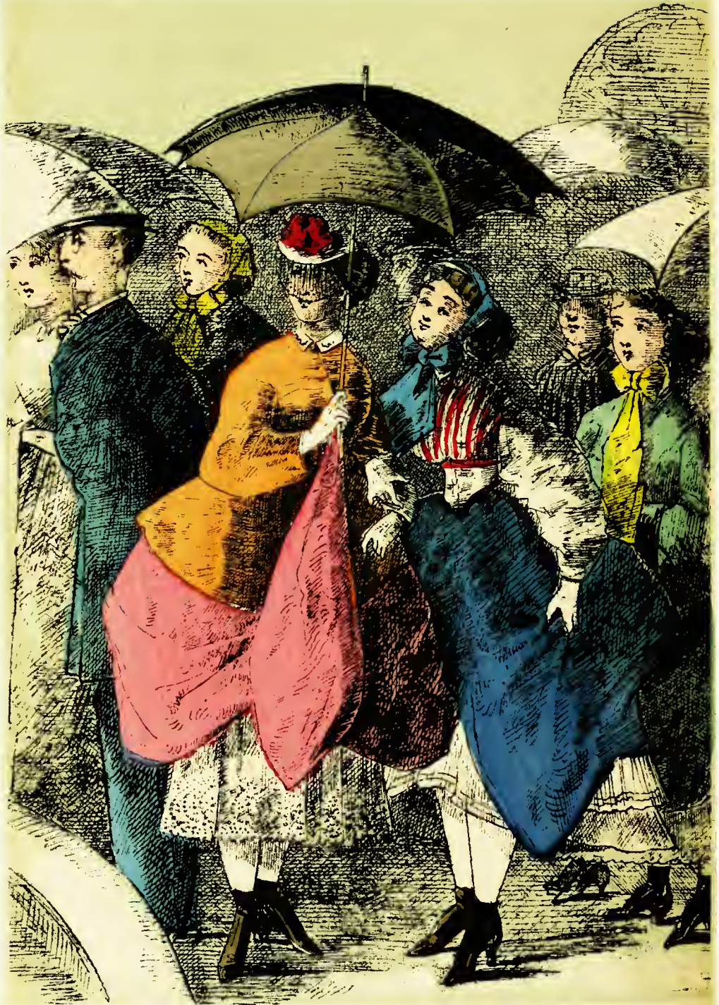
THE CRYSTAL PALACE