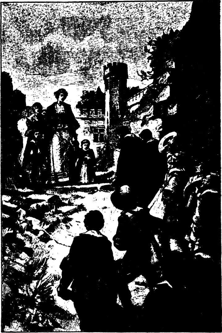
"The lady of the Castle appeared at the top of the breach."