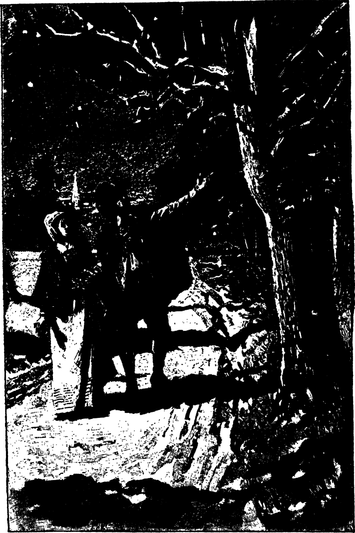
'Major Bridgenorth pointed to a huge oak.'