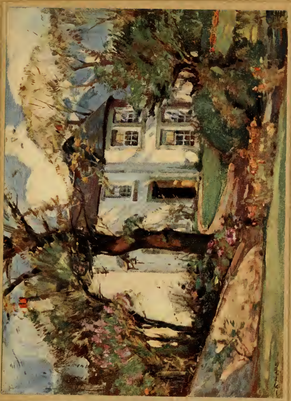
THE HOUSE AT ST. PETERSBURG

Painted by J. G. S. in 1880. The house is now in the possession of the State of Florida.