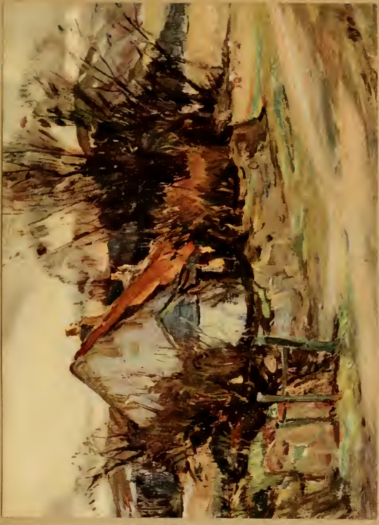
THATCHED HOUSE - 1885 - 1890 + 1891 - 1892 - 1893 - 1894 - 1895 - 1896 - 1897 - 1898 - 1899 - 1900 and 1901 - 1902 - 1903 - 1904 - 1905 - 1906 - 1907 - 1908 - 1909 - 1910