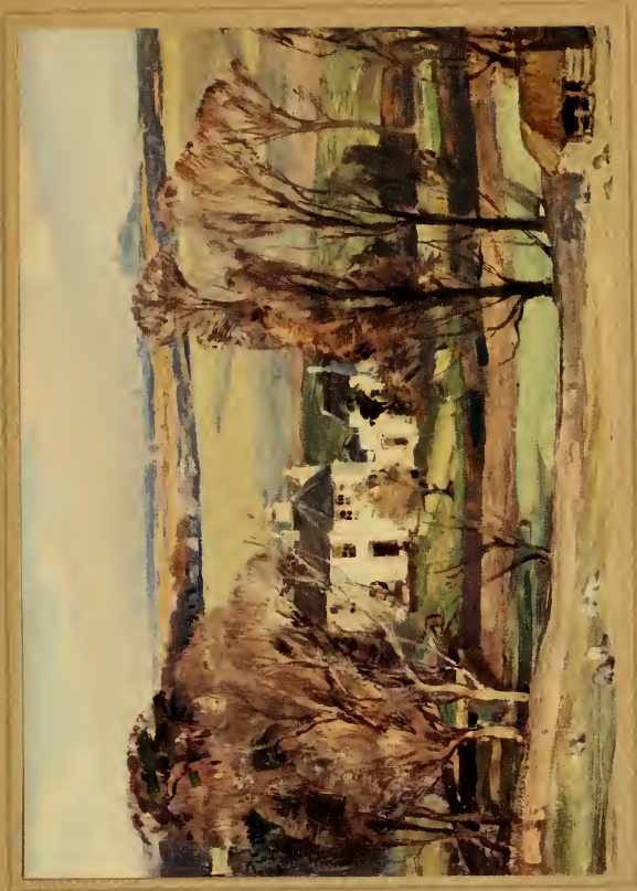
VIEW FROM FARMERS' COTTAGE 1880