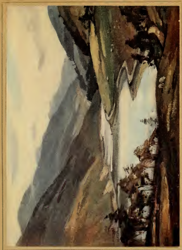
THE MOUNTAINS NEAR BULLOCK CREEK