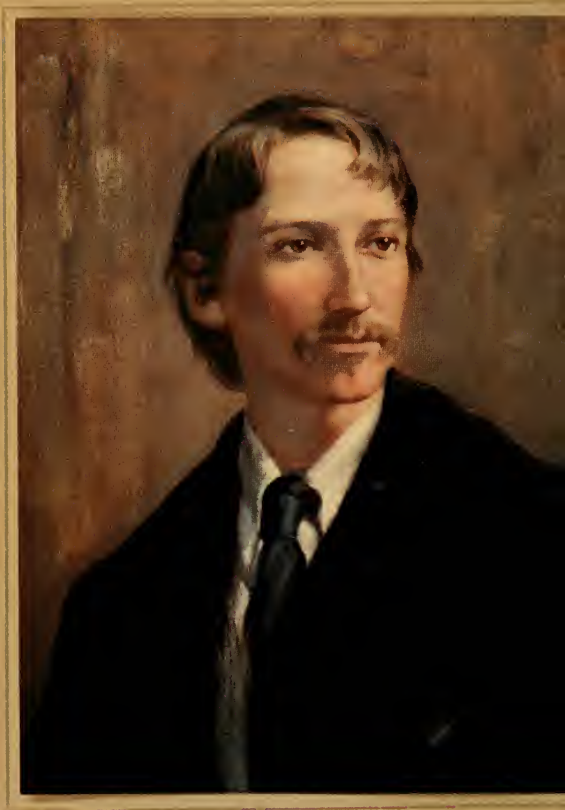
ROBERT LOUIS STEVENSON