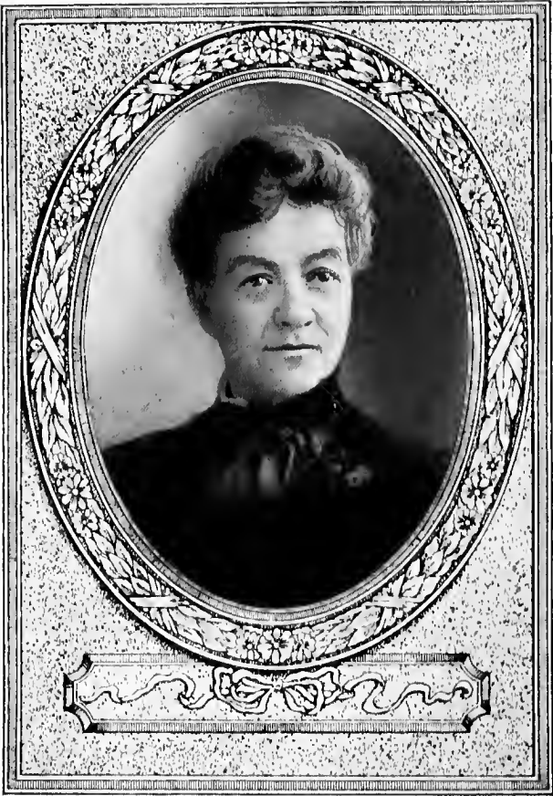
MRS. "JENNIE JUNE" CROLY