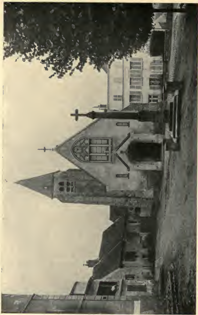
CHURCH OF BIÈVRE