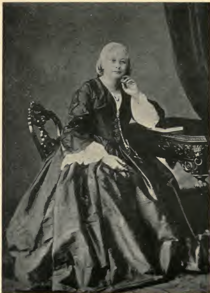
JULIETTE DROUET WHEN IN JERSEY