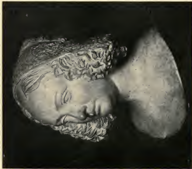
JULIETTE DROUET IN 1846