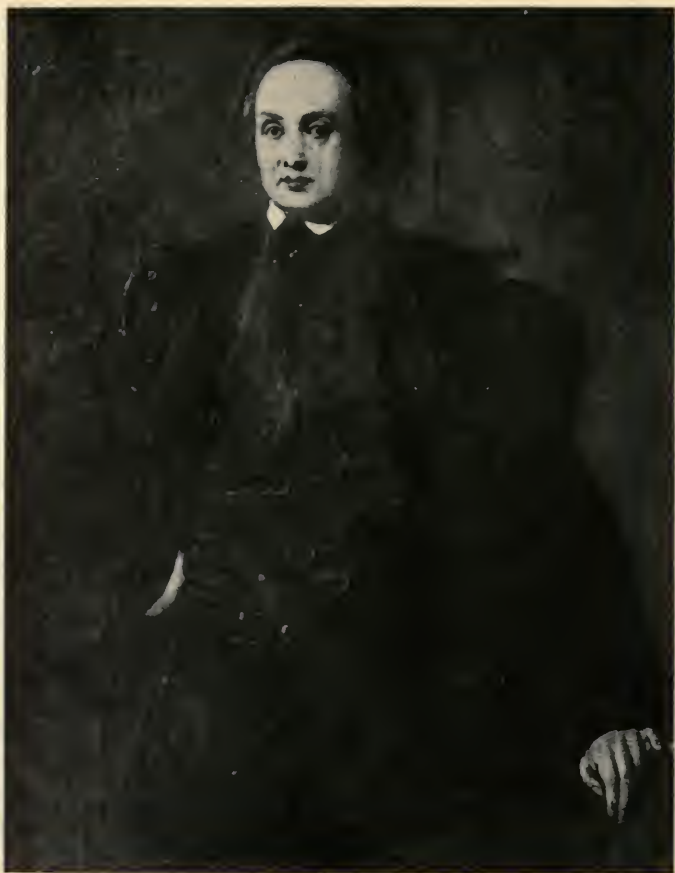
VICTOR HUGO, ABOUT 1836 From a picture by Louis Boulanger.