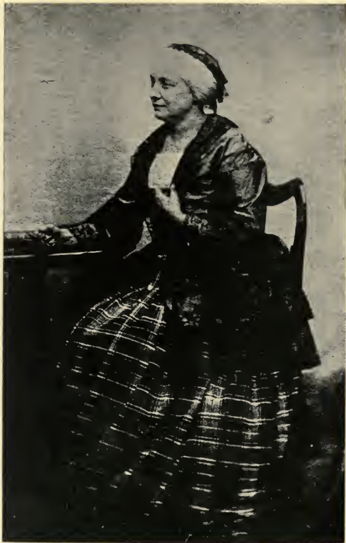
JULIETTE DROUET, ABOUT 1877