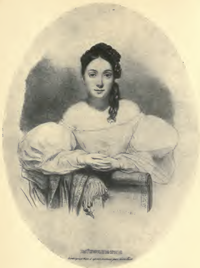
JULIETTE DROUET AT TWENTY-SIX