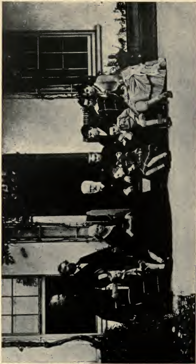
VICTOR HUGO AND HIS FAMILY AND JULIETTE DROUET AT HAUTEVILLE HOUSE