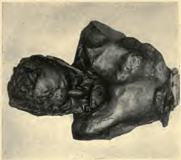
VICTOR HUGO, BY RODIN