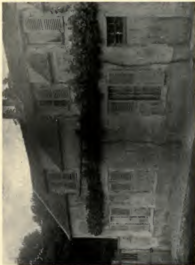
HOUSE IN THE VILLAGE OF METZ IN WHICH JULIETTE DROUET LIVED WHILE VICTOR HUGO WAS STAYING AT LES ROCHES