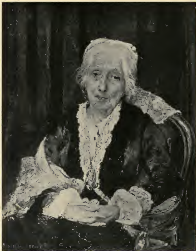
JULIETTE DROUET IN 1883 From the picture by Bastien-Lepage.