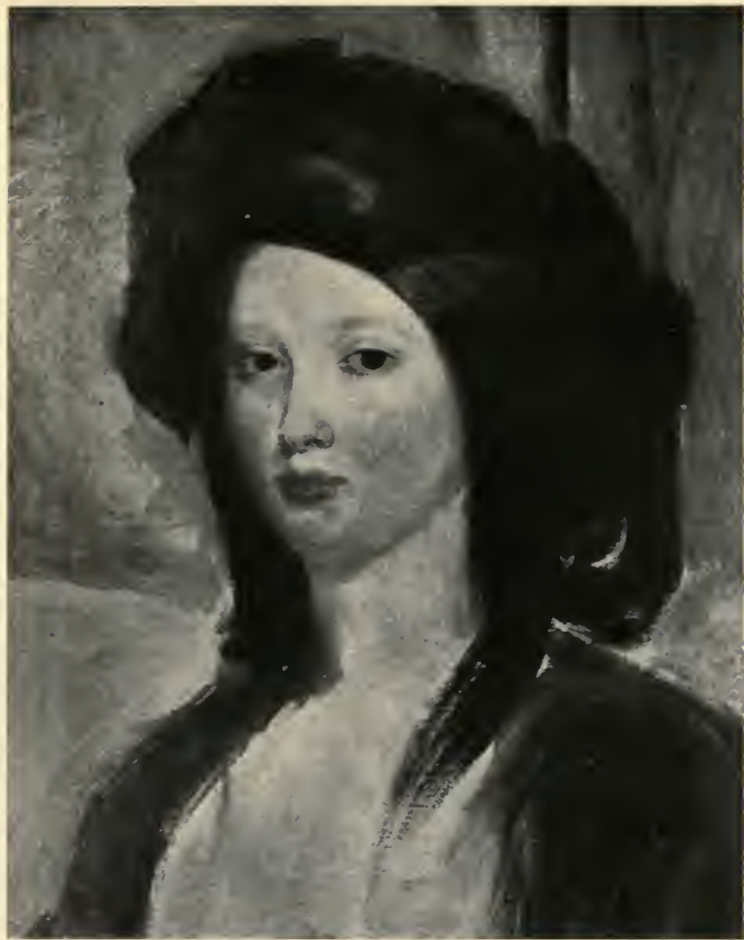
JULIETTE DROUET, ABOUT 1920 From Champmartin's picture.