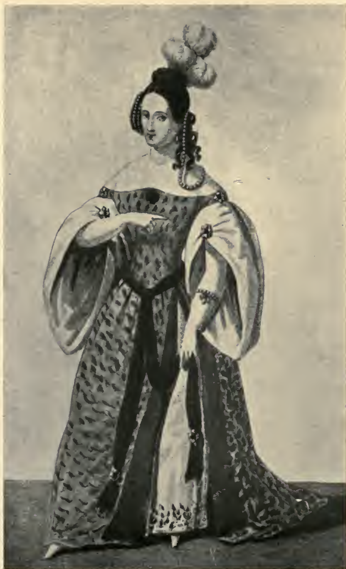
JULIETTE DROUET IN THE RÔLE OF THE PRINCESS NÉGRONI