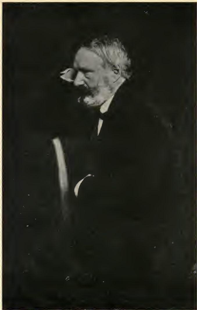
VICTOR HUGO WHEN IN JERSEY