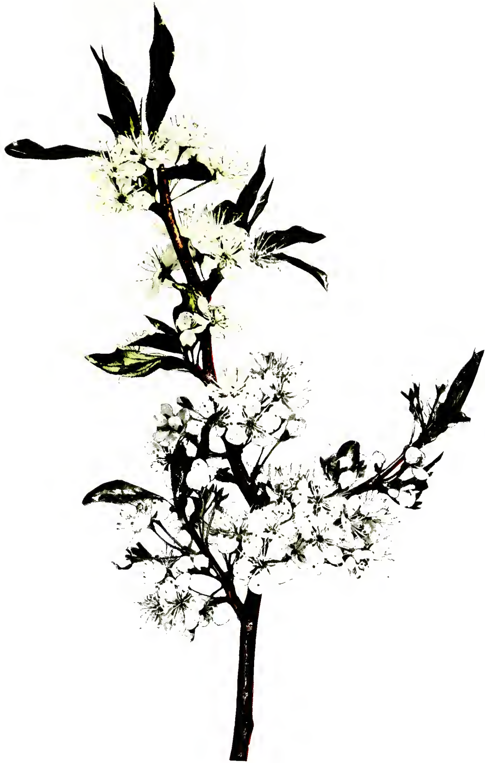
PRUNUS HORTULANA MINERI