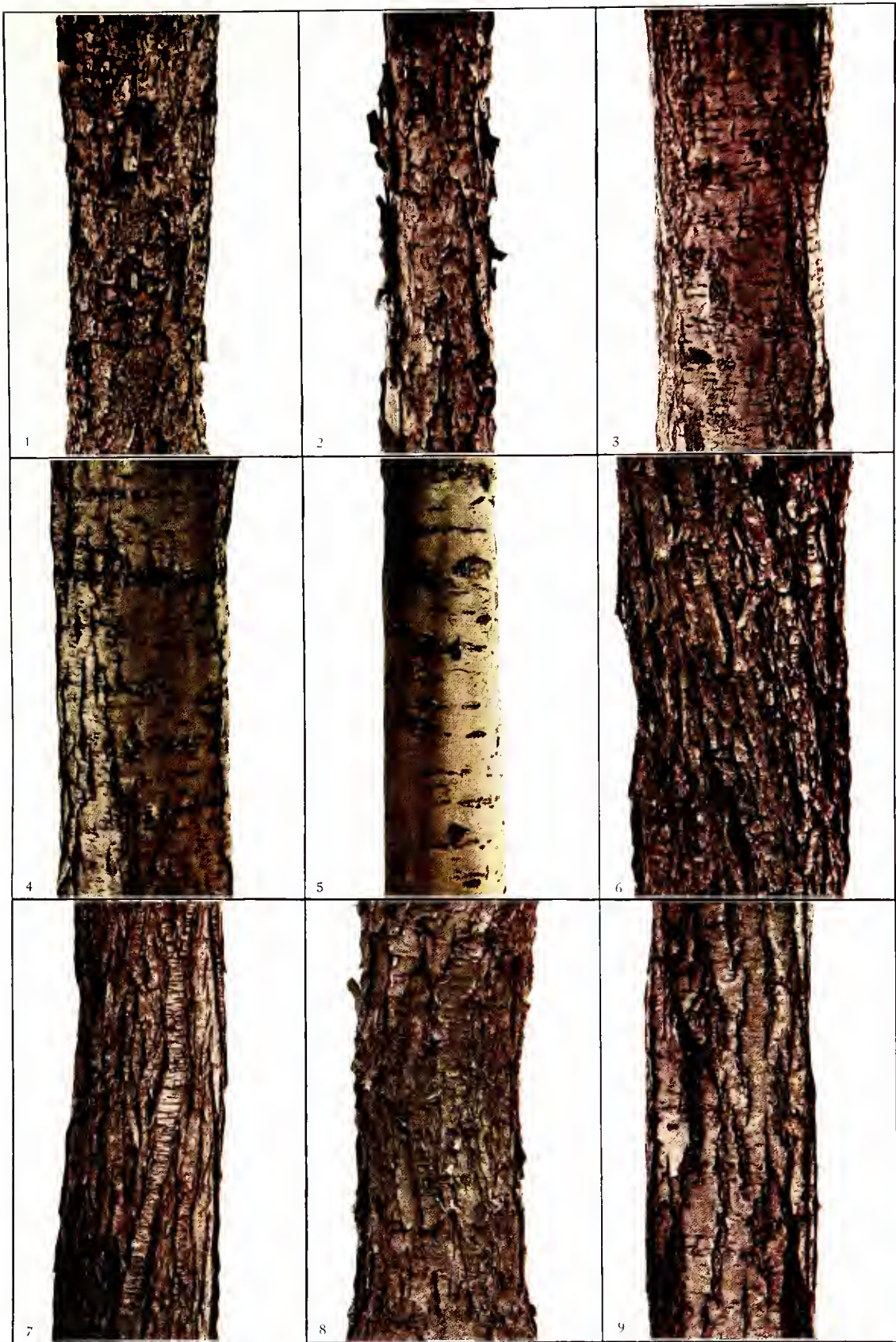
1. P. HORTULANA MINERI 2. P. AMERICANA 3. P. CERASIFERA