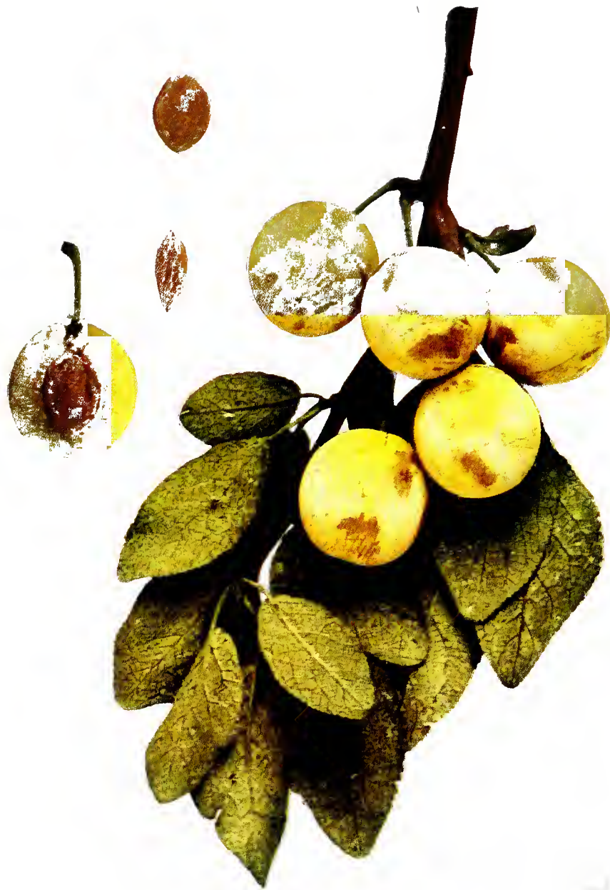
DRAP D' OR