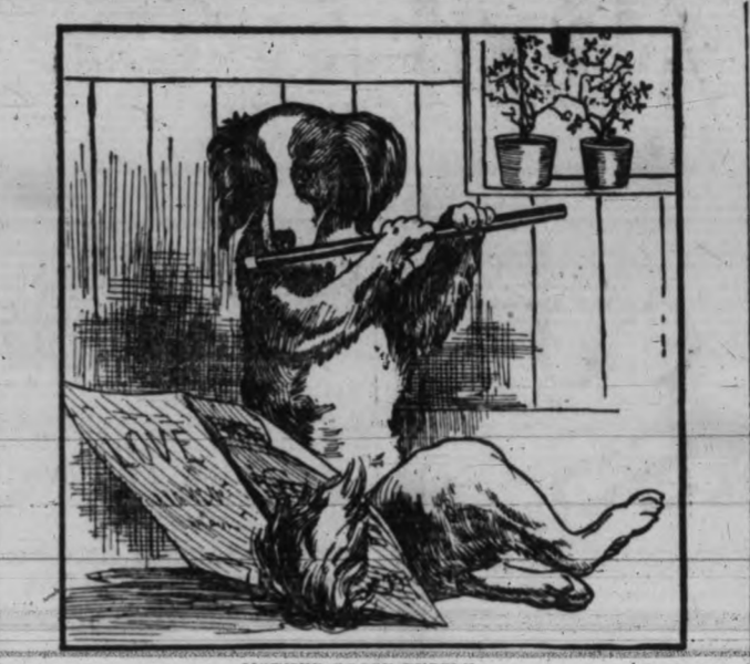
MOTHER GOOSE PUZZLE. She went to the fruiter's to buy some fruit. And when she came back He was playing the flute. Find two human musicians.