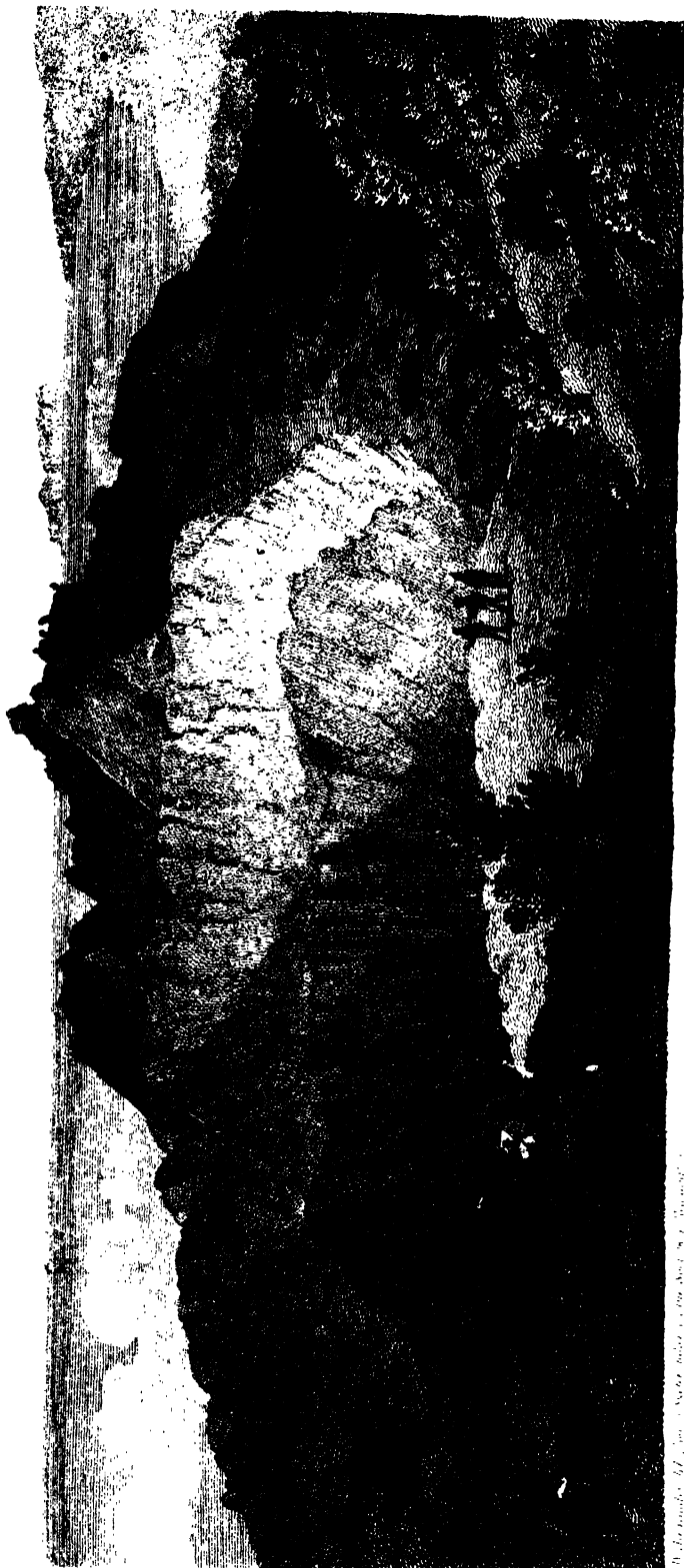
Photographed by J. W. M. in 1859. Photo. Album. No. 1. 1859.