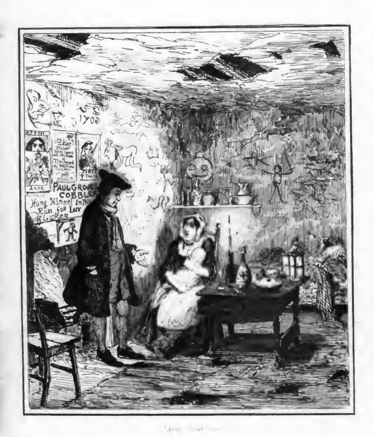
W Mired offers to add tot little les Veryand