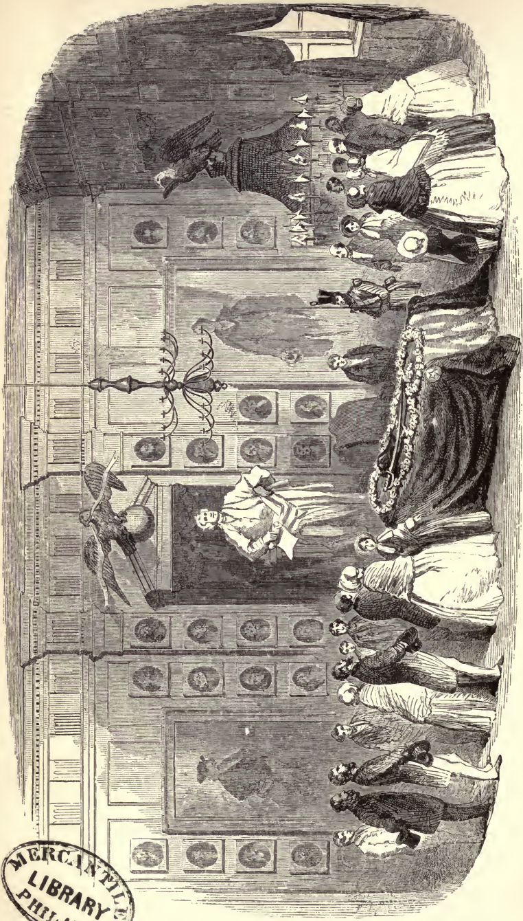
DR. KANE'S BODY LYING IN STATE, In Independence Hall, Philadelphia.