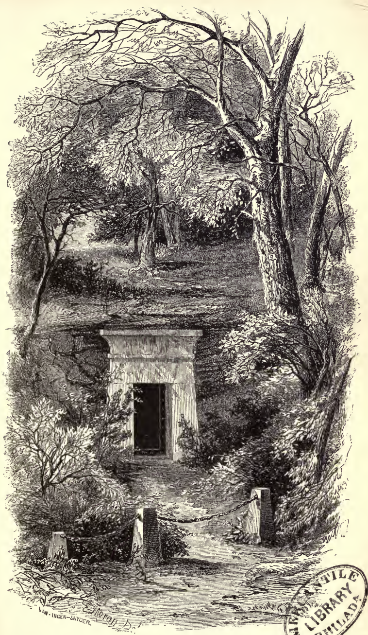
TOMB OF DR. KANE, In Laurel Hill Cemetery, near Philadelphia.