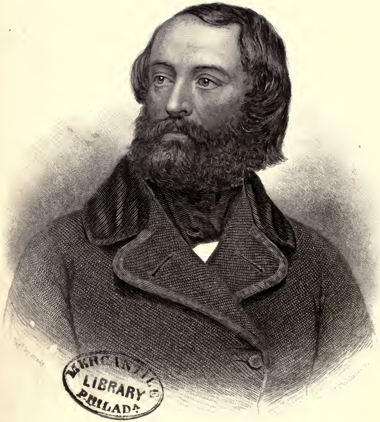
ELISHA KENT KANE, M. D., U. S. N.