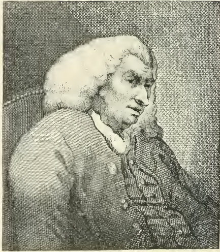
SAMUEL JOHNSON, LL.D.