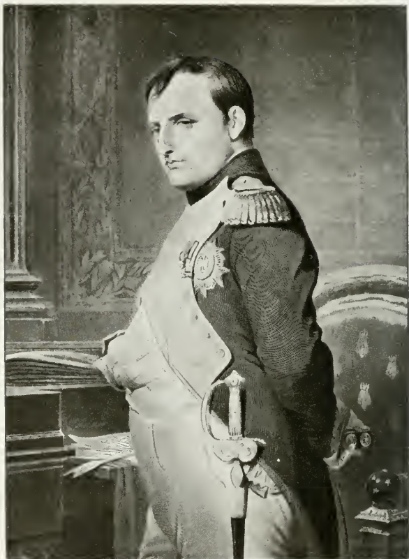
After the picture by Paul Delaroche.