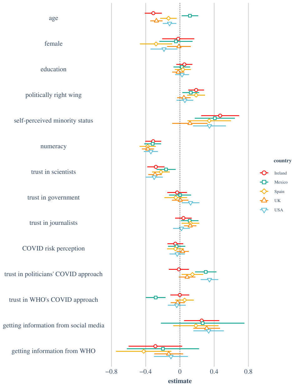
Figure 2. OLS multiple linear regression model for susceptibility to misinformation about COVID-19 by country. Note: results are mean-centred and scaled by 1 s.d. for comparability. Left of the dotted line (i.e. negative values) indicates reduced susceptibility to misinformation.

A number of factors stand out as significant predictors of susceptibility to misinformation across the board. Both higher performance on the numeracy tasks and higher trust in scientists are significantly and consistently associated with lower susceptibility to misinformation about COVID-19 in the pooled model and in all countries surveyed. In addition, being older is also associated with lower susceptibility to misinformation in the pooled model and in all countries, except in Mexico, where the effect is also significant but reversed. 9 Political ideology is significant in three out of five countries; identifying as more right-wing or politically conservative is associated with higher susceptibility to misinformation about COVID-19 in Ireland, Mexico and Spain, but notably not the USA and the UK. Self-identifying as a member of a minority group is also significantly associated with higher susceptibility to misinformation about the virus in all countries except the UK. Higher trust that politicians can effectively tackle the COVID-19 crisis predicts higher susceptibility to misinformation in Mexico, Spain