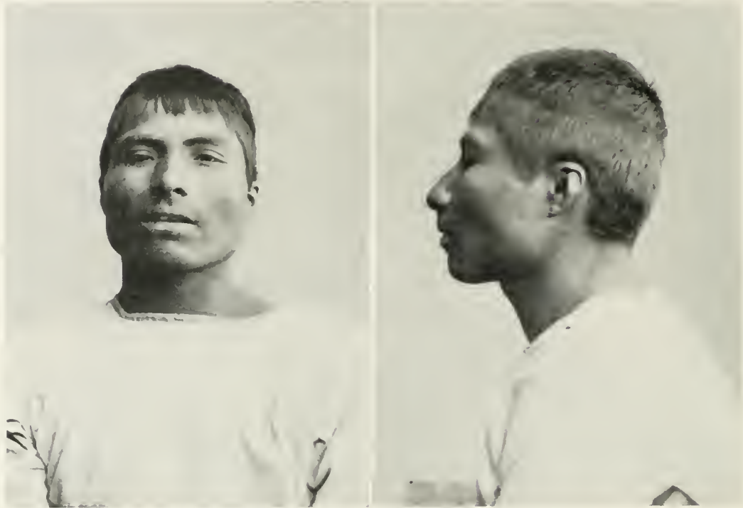
FIG. 9. TRIQUI: CHICAHUANTLA, STATE OF OAXACA

between the nose and the forehead varies from high to medium and is of medium width; while the nose is frequently aquiline, the tip is wide and flat. The lips are moderately thick and project somewhat. The ears are round and close to the head, though they tend to stand off considerably below. The helix border is thin and slightly turned-in above, rather thick and flat below; the lobe is large, round, and attached. The face is often absolutely large and is broad and heavy below. The color of the skin is dark brown — from 13 to 16.