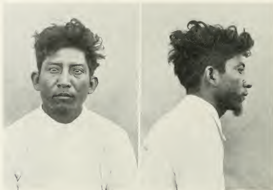
FIG. 17. CHONTAL: TEQUIXTLAN, STATE OF OAXACA