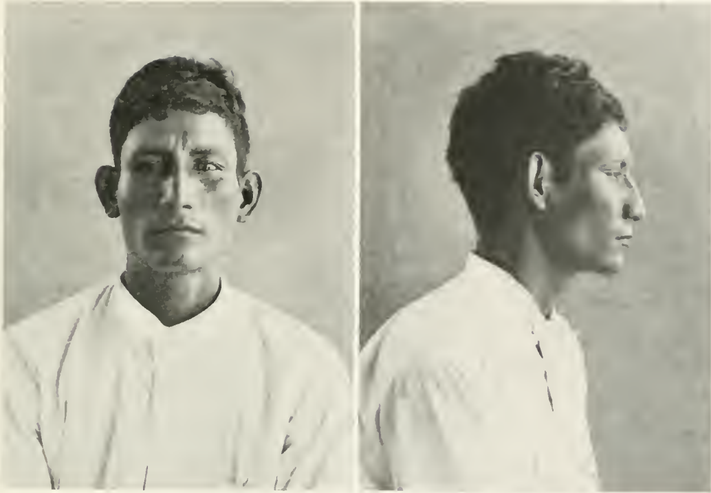
FIG. 14. TEHUANTEPEC ZAPOTEC: SAN BLAS, STATE OF OAXACA