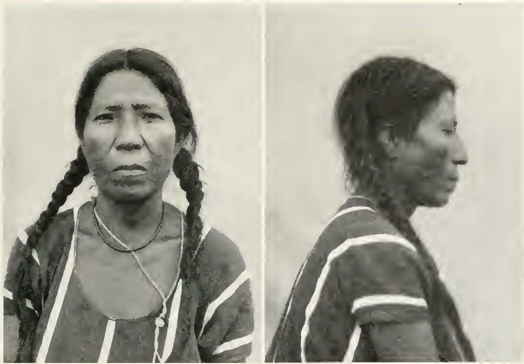
FIG. 18. CHONTAL WOMAN; TEQUIXISTLAN, STATE OF OAXACA

subjects showed a scanty to medium growth; only a third had any at all on the lower cheeks; more than half had a medium growth upon the chin; five-eighths had a medium and almost all the others a full moustache. This remarkable predominance of the moustache over the rest of the beard appears real, and not the result of shaving. The eyes are dark brown; only seven varied (one of these was blue-gray); they are widely spaced and are horizontal. The nose is large and rather long, often somewhat convex along the ridge; the root is high and narrow, and often presents a broad plateau, pinched up into a narrow ridge just where it joins the forehead. The lips are thin to medium; the upper lip is vertical or slightly projecting. The ear is round, stands off from the head, and is thin and rather open; the upper border of the helix is thin and rolled inward, the lower border is thick to thin and flat; the lobe varies in size and attachment, but is usually round. The color of the skin varies somewhat in individuals, but the commoner shades are represented by (13), (23), and (16) in our color-plate.