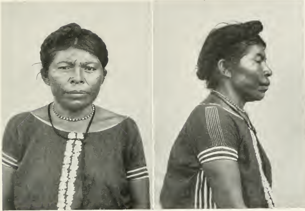
FIG. 16. JUAVE WOMAN: SAN MATEO DEL MAR, STATE OF OAXACA