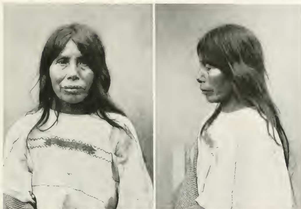
FIG. 10. TRIQUI WOMAN: CHICAHUANTLA STATE OF OAXACA