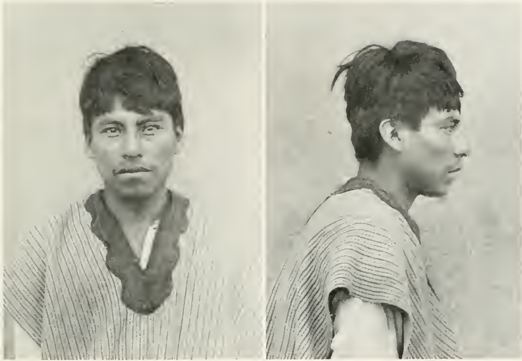
FIG. 23. TEPEHUA: HUEHUETLA, STATE OF HIDALGO