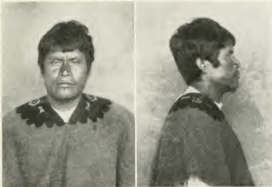
FIG. 24. TOTONAC; PANTEPEC, STATE OF PUEBLA