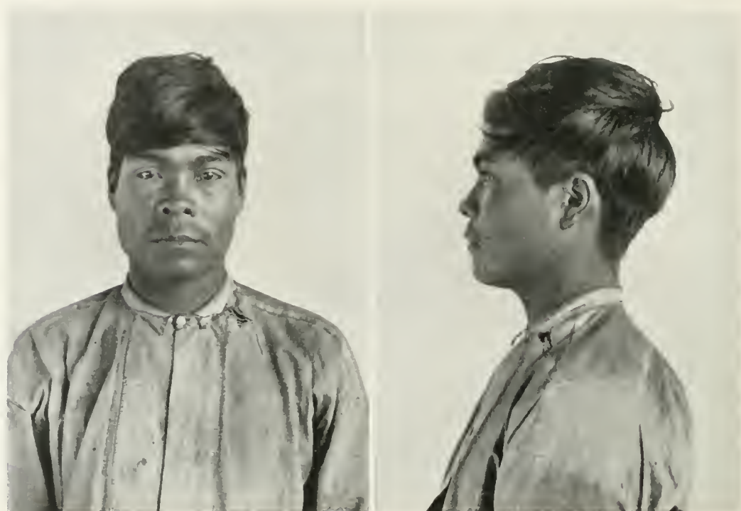
FIG. 3. TARASCAN (YOUNG TYPE): SANTA FE DE LA LAGUNA, STATE OF MICHIOACAN

tribes, the beard among the Otomis shows greater variation in form or texture, in color, and in turning gray, than the hair of the head. Both, however, show much variation: in more than 30 per cent. of the subjects the beard varies from the normal straight and black condition; in something over 20 per cent. of subjects the hair of the head varies. The head is long. The skin is a light yellow or whitish, curiously ruddy, and blotched with red, purple, or blue. The face is flat and broad.—The other type is little, dark brown (16), and has a much more agreeable facial expression: the eyes are less widely-spaced, and the eyebrows often meet: the root of the nose is flat, depressed, and often squarish: the nose is narrower and better-shaped than in the previous type. The individual represented in the cut belongs to this little type.