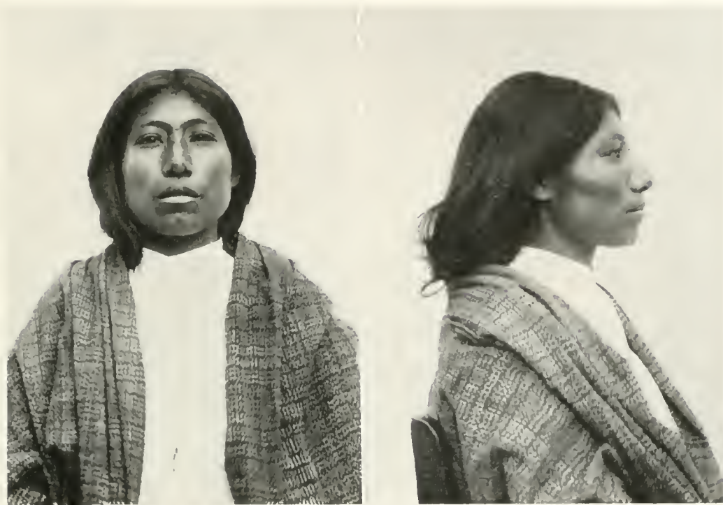
FIG. 7. AZTEC WOMAN: CUAUHTLANTZINCO, STATE OF PUEBLA

are rather often brown, and not almost black; this occurred in 20 per cent. of cases. Nineteen mothers had borne one hundred and sixteen children, of whom just half had died. The largest family in the series was of eighteen children. Two women were barren.