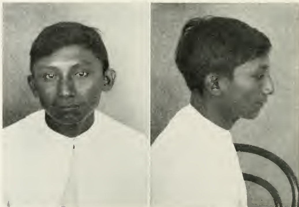
FIG. 26. MAYA: TEKAX, STATE OF YUCATAN