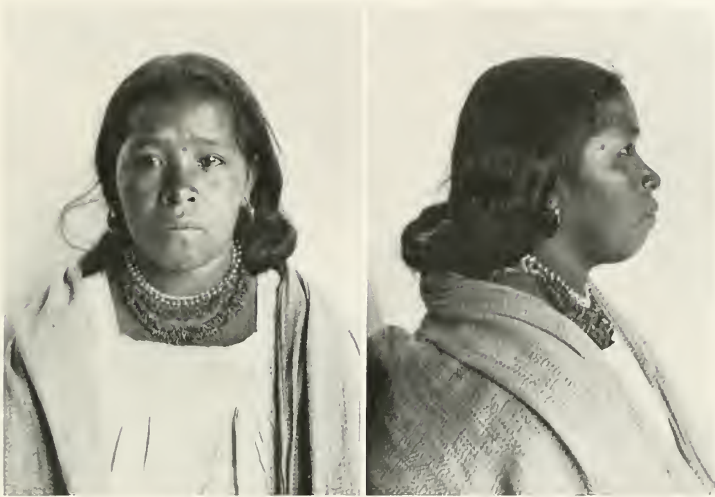
FIG. 1. TARASCAN GIRL: SANTA FE DE LA LAGUNA, STATE OF MICHOACAN