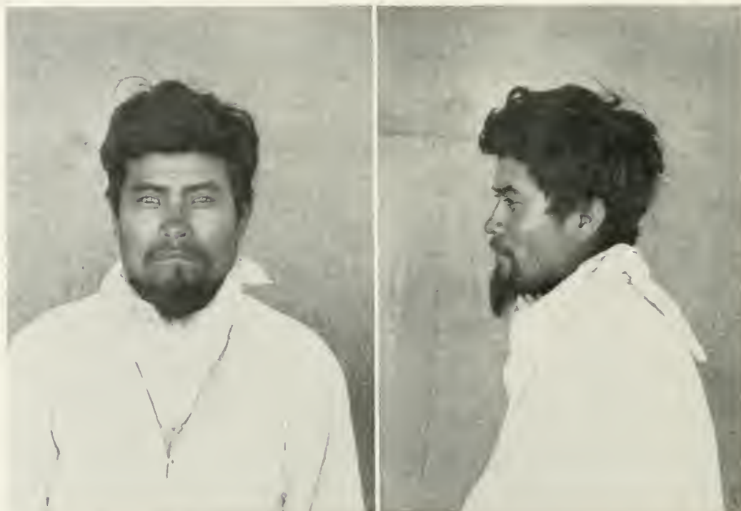
FIG. 21. CHOCHO: COIXTLAHUACA, STATE OF OAXACA