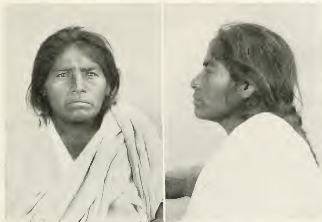
FIG. 12. ZAPOTEC WOMAN: MITLA, STATE OF OAXACA

addicted to drunkenness. We incline to attribute this abuse of intoxicants to climatic conditions. Cold and heavy fogs sweep up the mountains from the coast daily and their chill penetrates to the very bone. Wherever, in the high mountains, fogs are abundant and precipitation occurs almost constantly, we find the same conditions. The Mixes and the Chinantees, in their magnificent, forest-clad, abundantly-watered mountains, are almost equally addicted to drink.