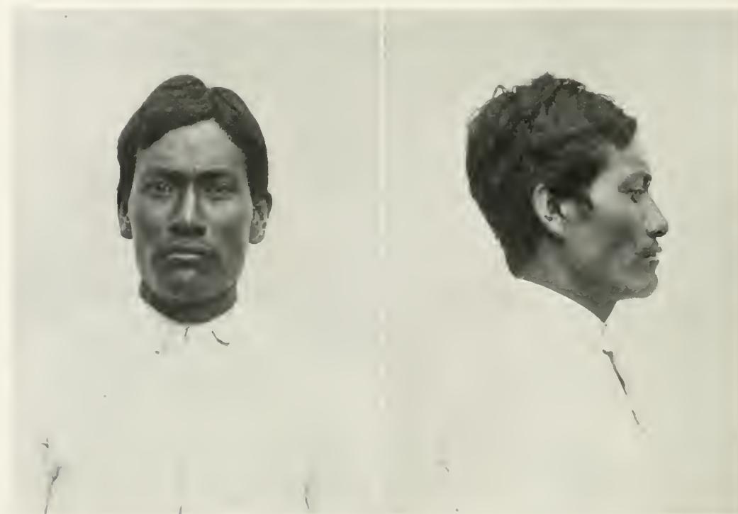
FIG. 6. AZTEC: CUAUHTLANTZINCO, STATE OF PUEBLA