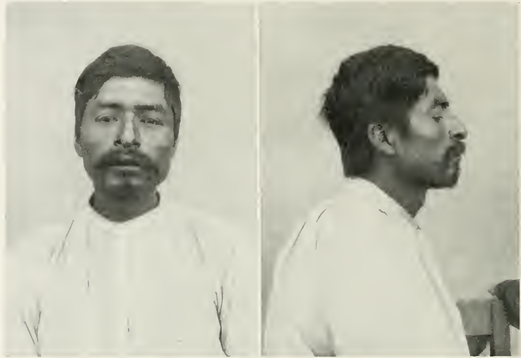
FIG. 19. CUICATEC: PAPALO, STATE OF OAXACA