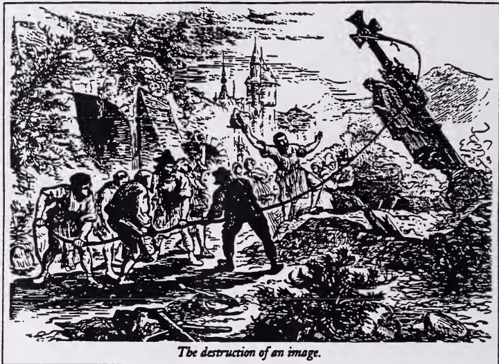
The destruction of an image.

T HE ATTACKS of Iconoclasts upon Popish images have often been regarded as the activities of extremists on the fringe of the Protestant Reformation. Yet, the Reformation was not merely a struggle over the doctrine of justification; it was a battle for the proper worship of the living God. Carlos Eire demonstrates that the Continental Reformers issued a preeminent call to purge Romish corruptions from worship; and, thus, iconoclasm was an integral part of the program to Reform worship.