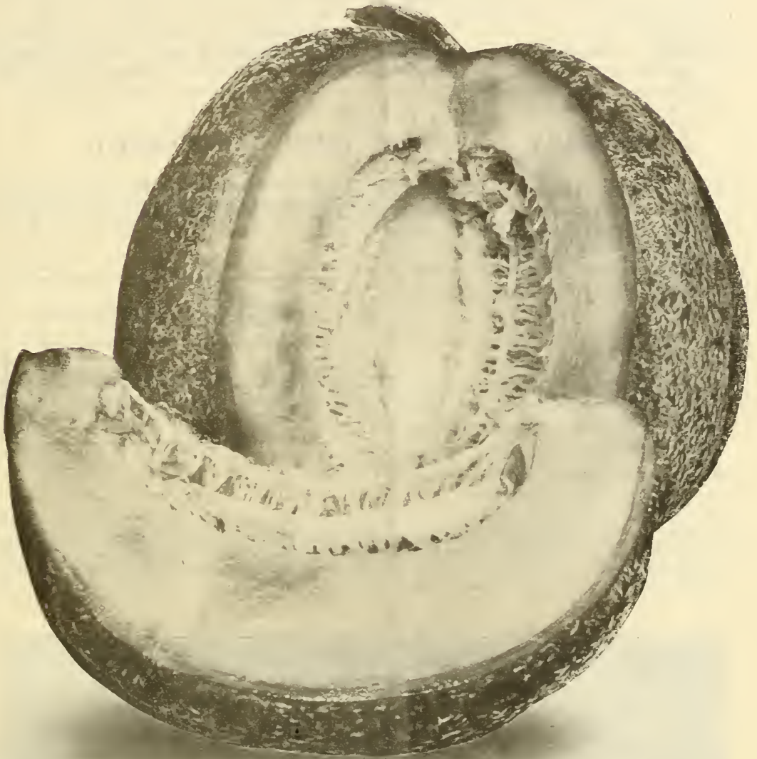
MELON, FARQUHAR'S HONEYDROP.