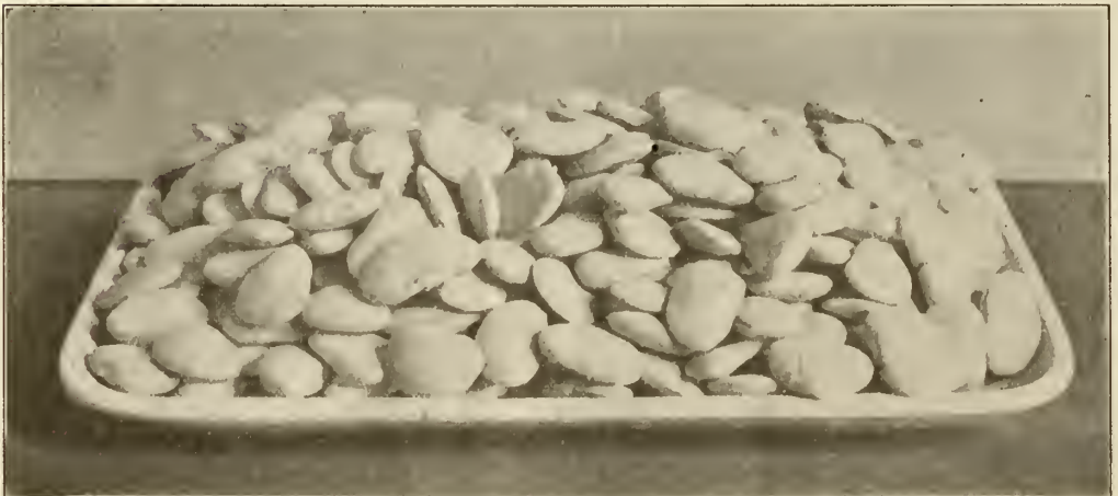
Burpee's Bush Lima Improved.