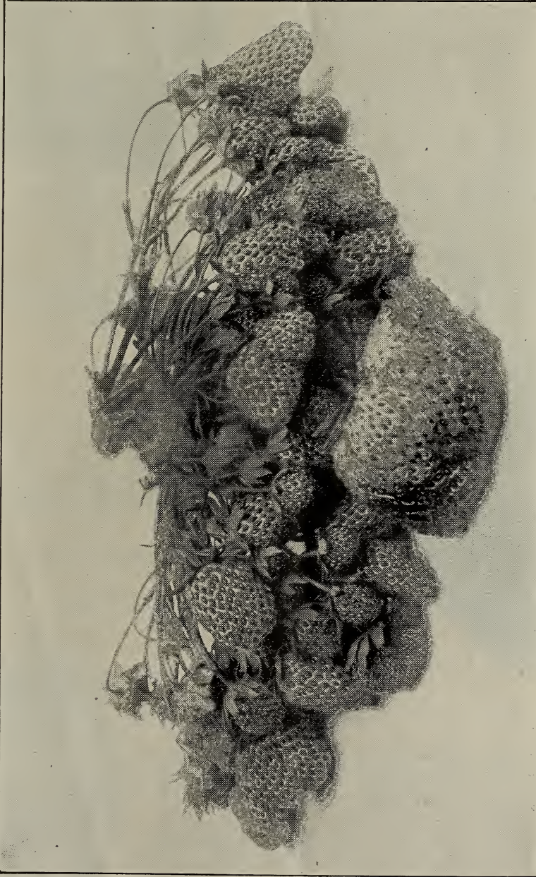
This is a single cluster of the Mark Hanna straw berry, fertilized by Thompson's No. 2. It is no doubt the largest cluster of berries ever produced, I think. Its beautiful shape and color makes it sell well. It is a splendid berry to carry over night, as the color does not change. It grows to a very large size, having such dark green healthy foliage. It is amply able to mature its wonderful crop of berries, which simply lay in heaps and piles and commences very early and will last for weeks in fruit.

MARK HANNA.—Well, it is needless for me to say anything about this berry, see what others say, if you are convinced. It must be remarkable, try it, if only a dozen plants, but I can assure you were I not in the plant business you could not get one for $100, and I stand ready to give any man $100 for two plants of any new variety that will excel it in health and vigor of plant, productiveness and large clusters. If there is a berry in the world that equals it I have never seen or heard of it. It is hardly ever I see a barren plant. It is no uncommon thing to count 25 to 50 berries on a single stem. The illustration is reduced, but it is only one single cluster.