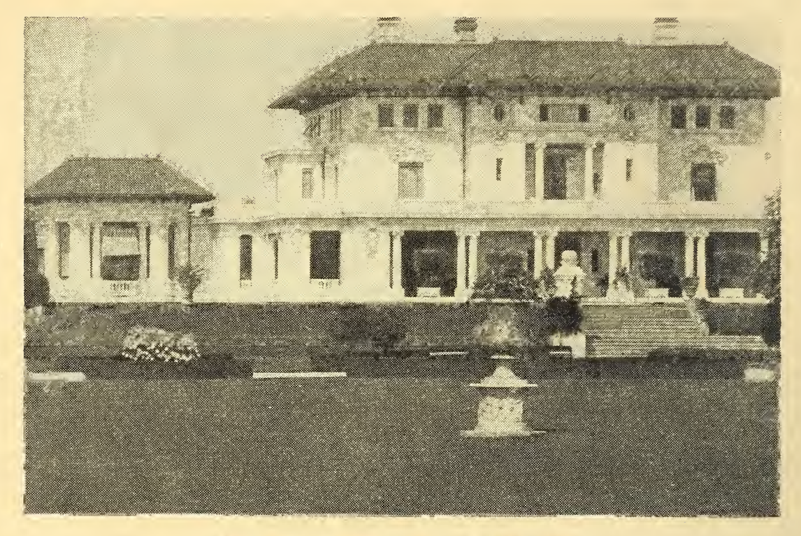
Burnett's Special Lawn Grass Seed

USED ON MANY OF THE MOST FAMOUS LAWNS IN AMERICA