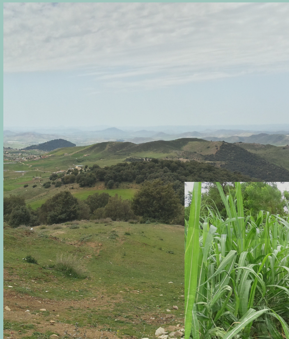
Reda Abouakil CC-BY-SA 4.0