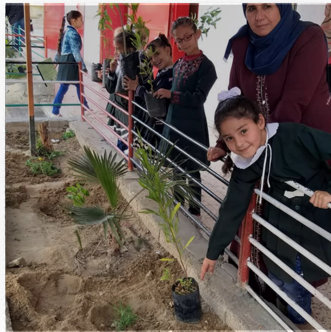
Zaid462 CC-BY-SA 4.0