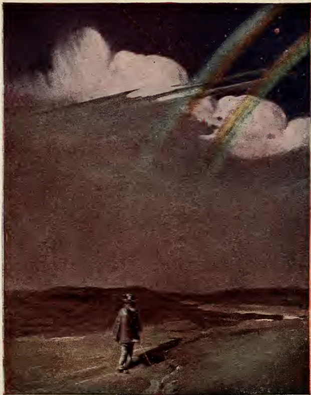
Twas a moon-rainbow, vast and perfect.