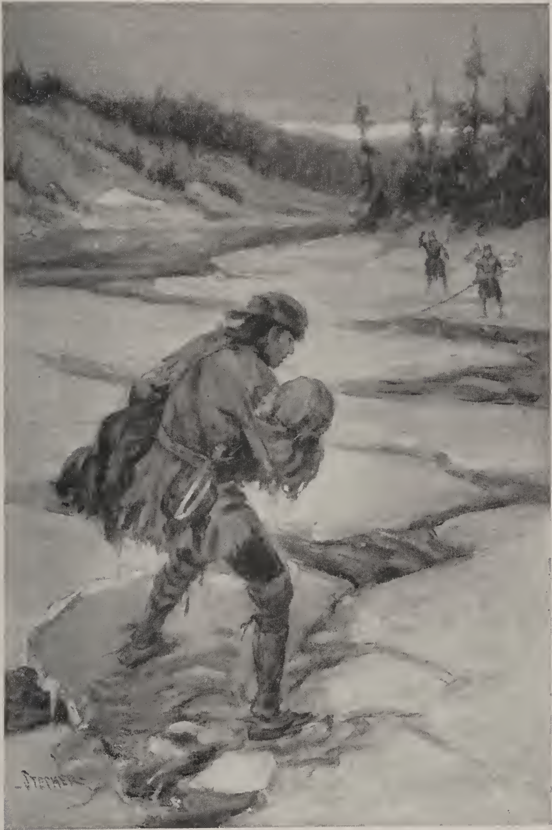
THE TREACHEROUS ICE BROKE UNDER HIS WEIGHT.—Page 259.