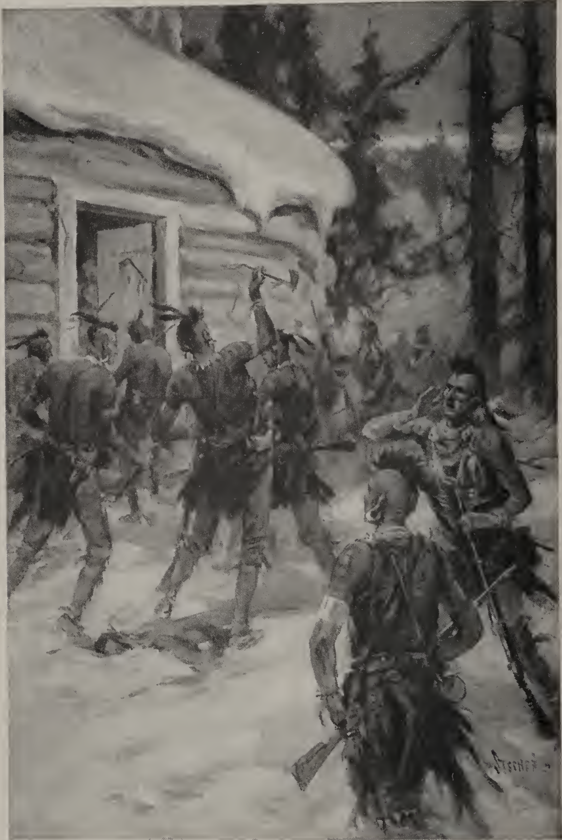
HE SAW A GROUP OF INDIANS HACKING AT THE DOOR. Page 195.