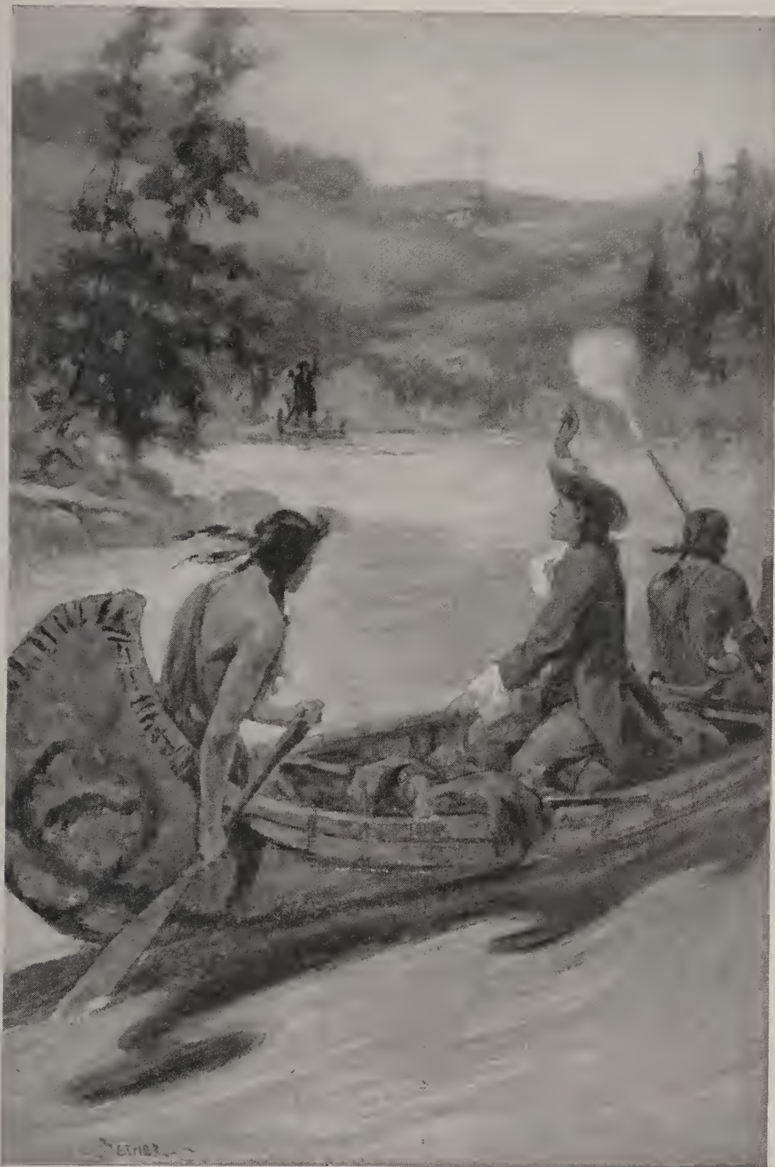
WAVING HIS HAND IN GREETING.—Page 64.