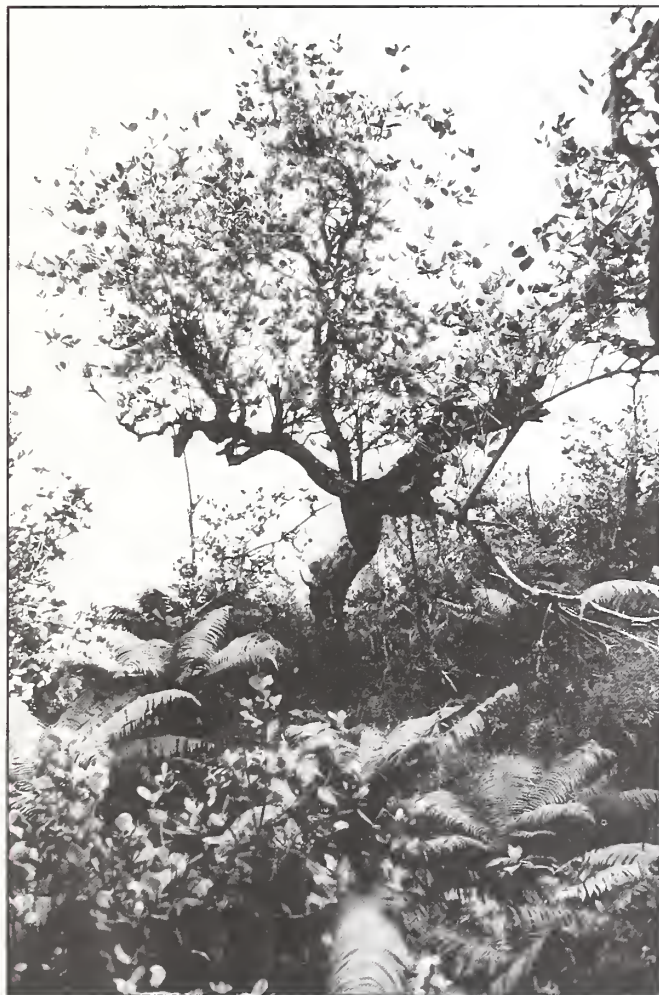
Figure 1.— Laurel sabino ( Magnolia splendens Urban) in the dwarf forest of Puerto Rico's Luquillo Mountains.

Magnolia splendens Urban, called laurel sabino in Spanish and magnolia in English, is an evergreen tree species endemic to northeastern Puerto Rico (fig. 1). When mature, laurel sabino supports a narrow, dark-green crown and may reach 25 m in height and 1.2 m in d.b.h. Identifying features include its large leaves that have a spicy taste when bitten into and that are covered with silky gray hairs; a terminal stipule that falls, leaving a ring scar on the branch; long, pointed terminal buds; and large white flowers (21, 31). Because the wood was highly regarded for use in furniture and cabinet making, laurel sabino was harvested in the Luquillo Mountains through the early 1950's (32, 40).