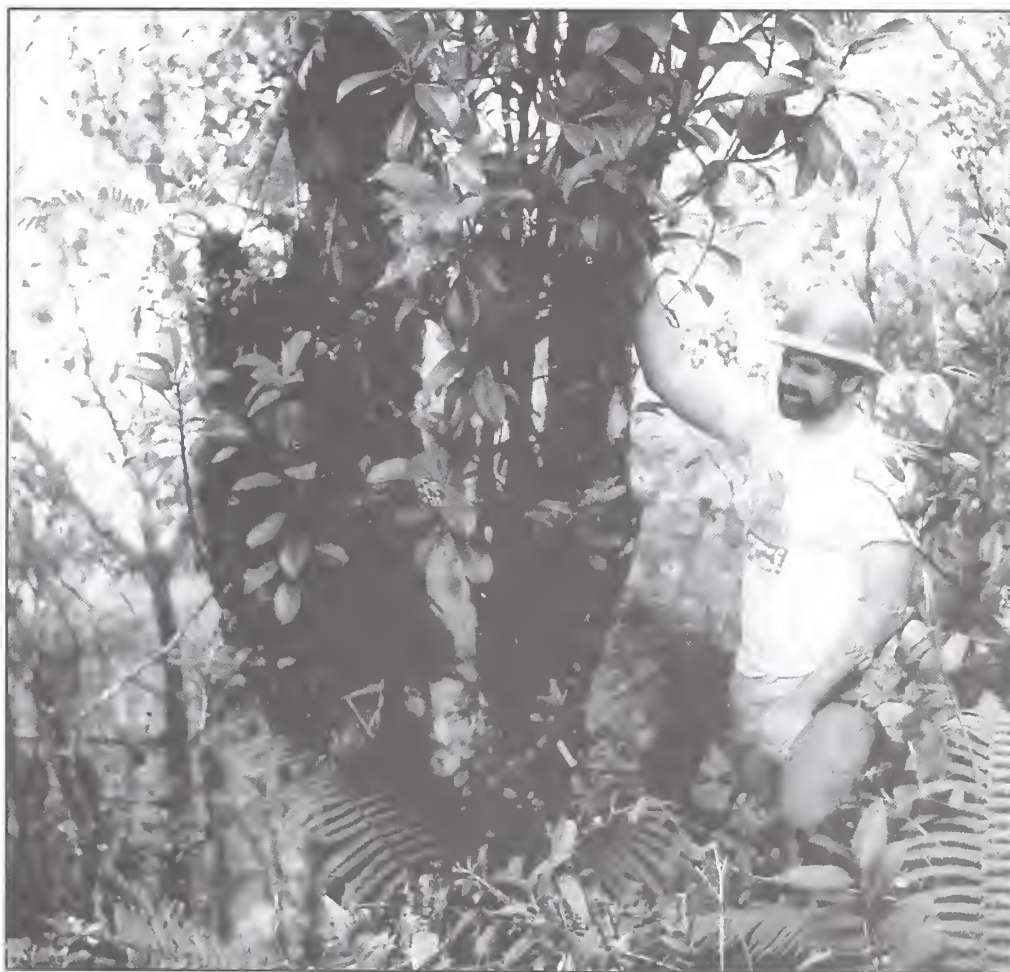
Figure 3. — Laurel sabino ( Magnolia splendens Urban) in the dwarf forest of Puerto Rico's Luquillo Mountains. Note the numerous sprouts at the base of the tree, possibly resulting from the effects of Hurricane Hugo in September 1989.

Vegetative Reproduction. — Laurel sabino trunks typically produce numerous new shoots or suckers (21). Much of this vegetative reproduction may be attributed to recovery after tropical storms or hurricanes (fig. 3).